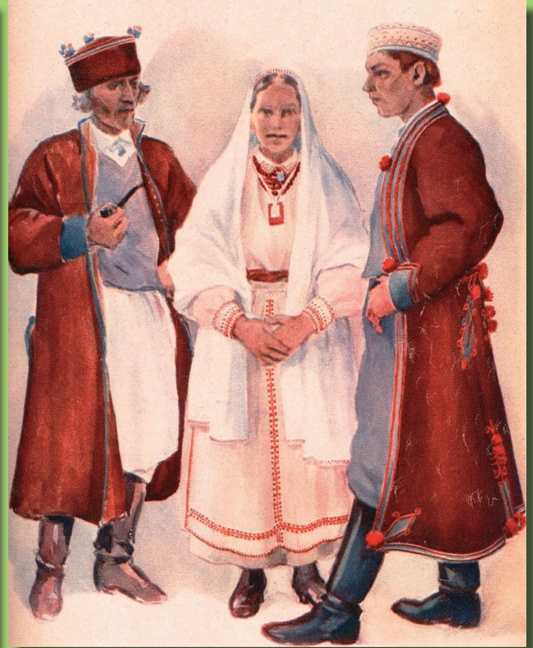
Bitgoraj costume, illustration by T.Korotkiewicz for "Kuryer Codzienny", 1938