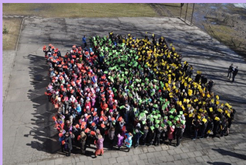
11 th March