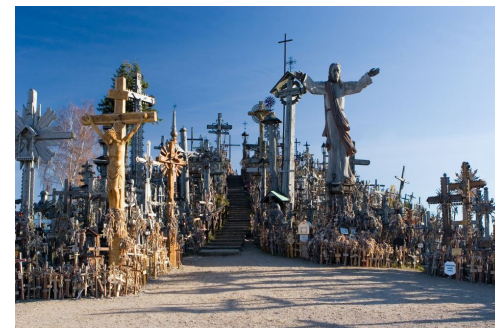
The Hill of Crosses