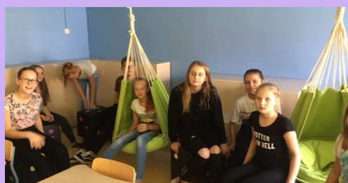
New school spaces