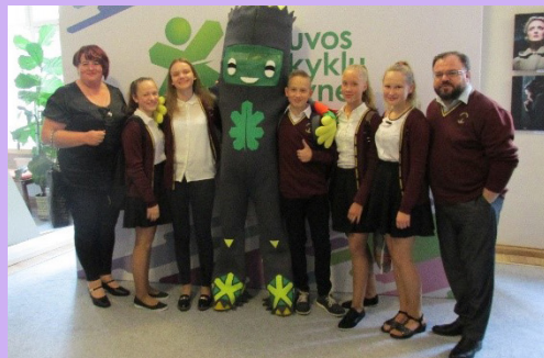
Lithuanian Schools games winners