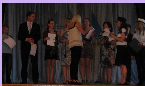
Awards event "Student of the Year"