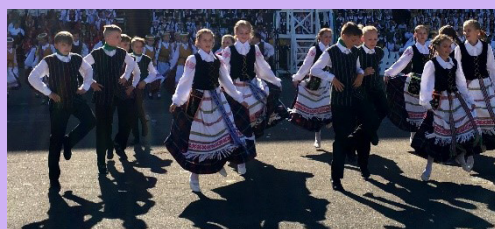
Folk dance group "Gedmina"