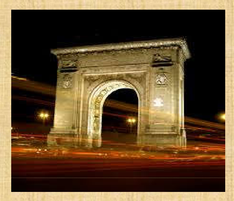
Arch of Triumph