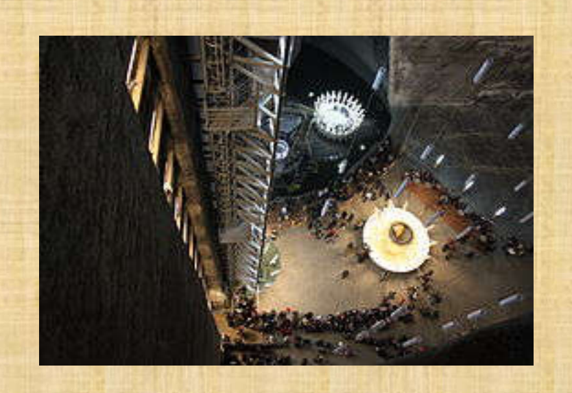
Salt mine Turda