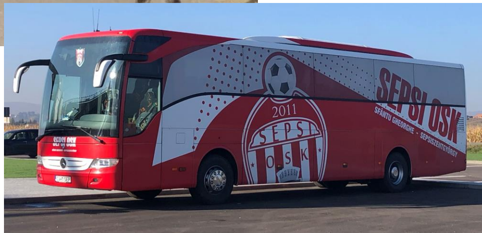
Wednesday 20 October 2021, Manon Tanneau.

Transports have always evolved from horse-drawn carriages to motor vehicles such as this coach on this road. This evolution is a necessary step, and it is influenced by the human's need to go faster and to bring more and more persons.