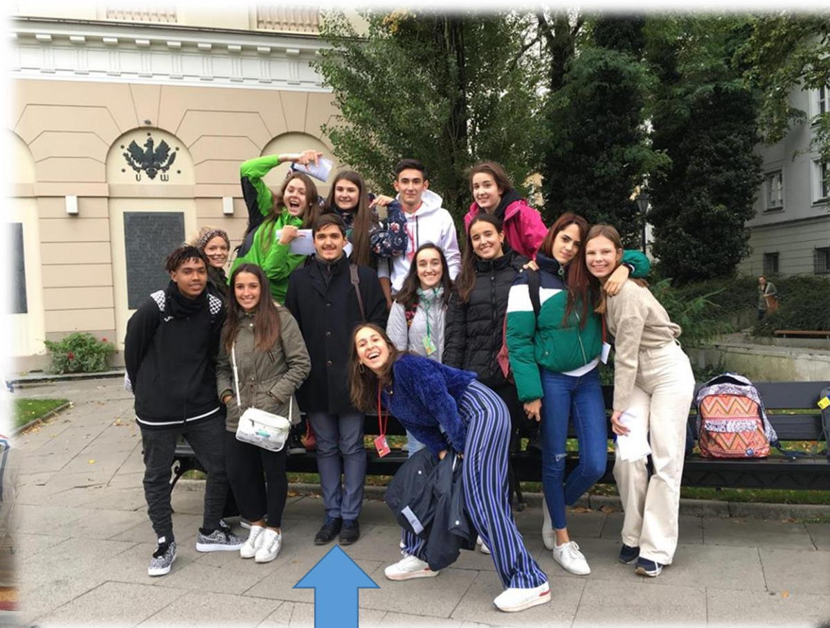
Handsome guy at the University