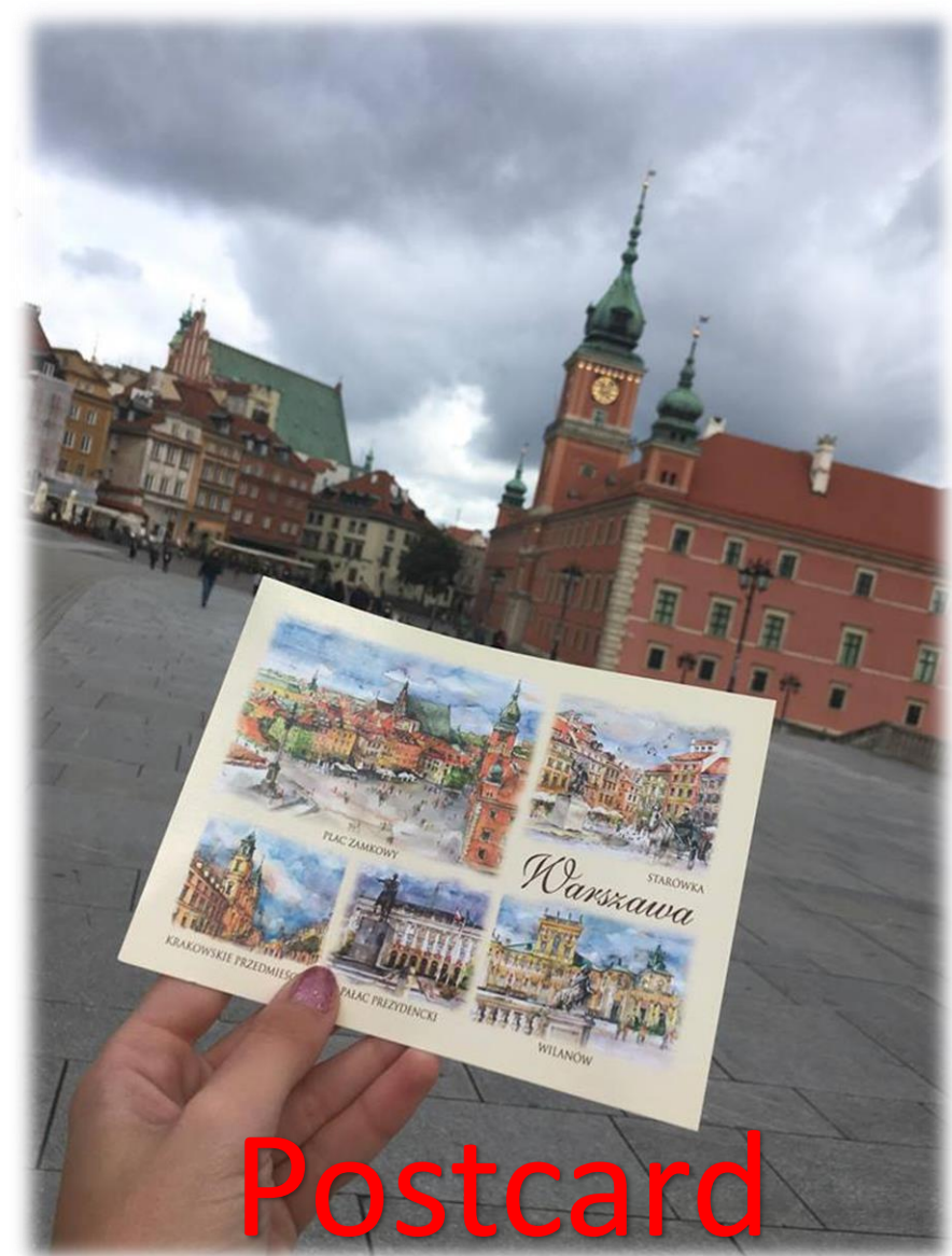
Postcard from Warsaw