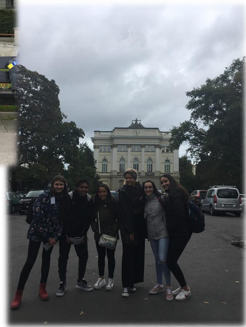
Models at the university