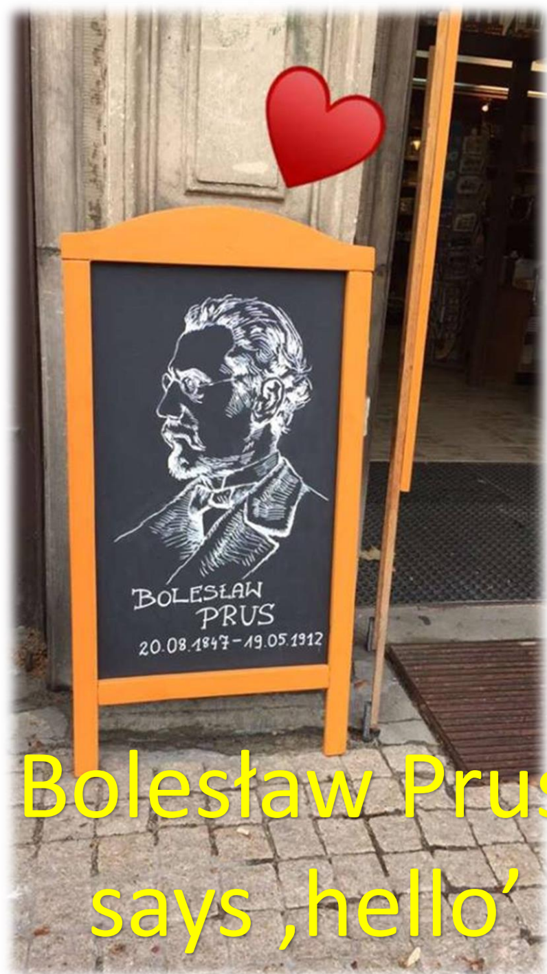
Bolesław Prus says 'hello'