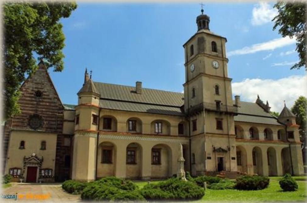
Abbey in Wąchock