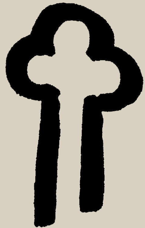
Sign of the Cistercian Trail