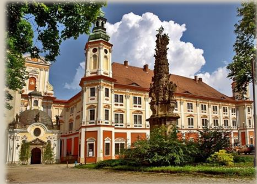
Abbey in Henryków