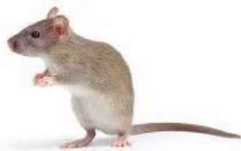
RATO - Mouse