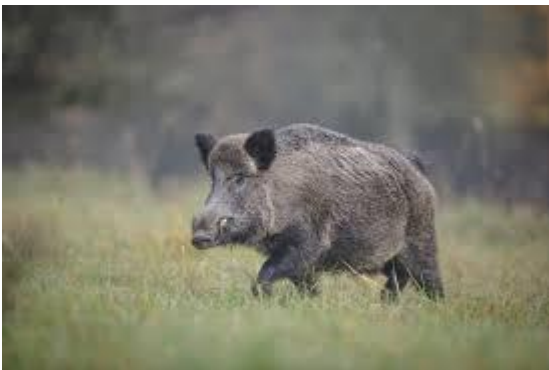
JAVALI - Boar