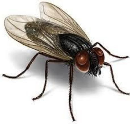
MOSCA – Fly