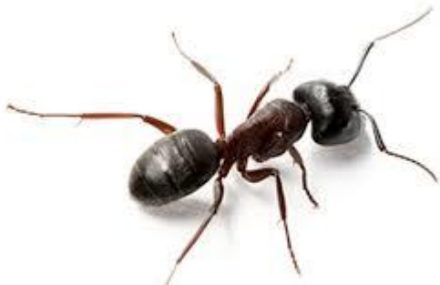
FORMIGA - Ant