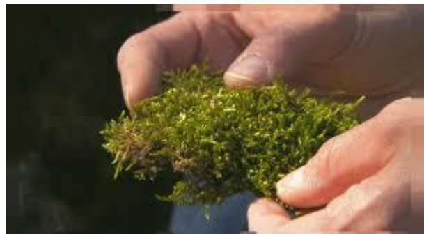
Musgo - Moss