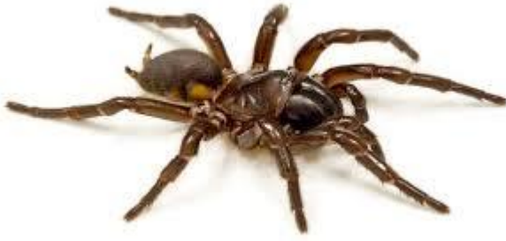
ARANHA - Spider