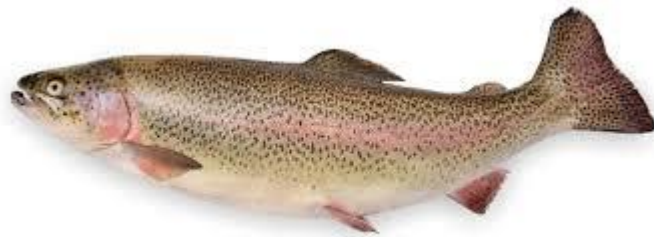
TRUTA - Trout