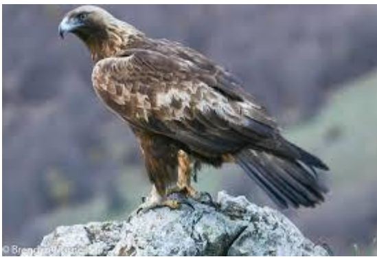
ÁGUIA - Eagle