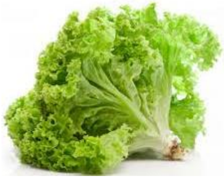
ALFACE - Lettuce