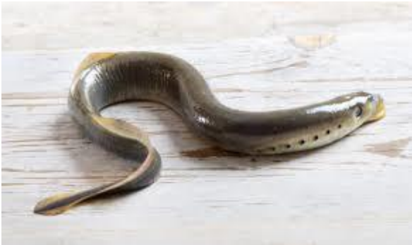
LAMPREIA - Lamprey