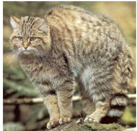
GATO BRAVO - Wildcat