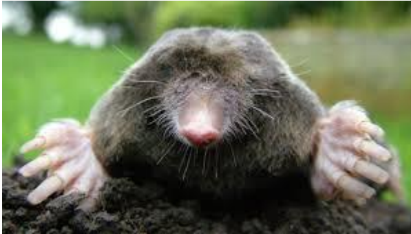
TOUPEIRA - Mole