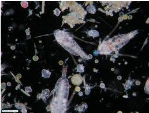
PLÂNCTON – MICRORGANISMOS