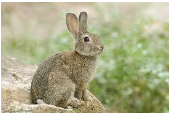
COELHO - Rabbit