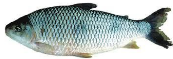
BOGA – Boga ?