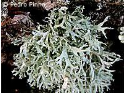
LÍQUENE - Lichen