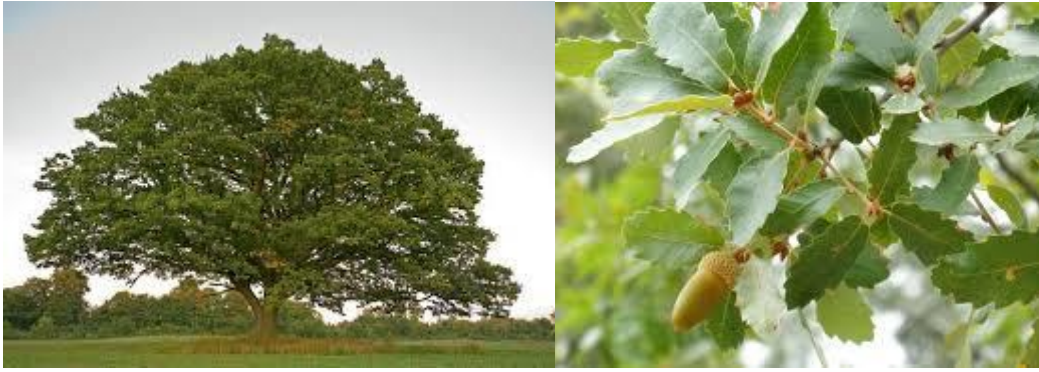
CARVALHO - Oak