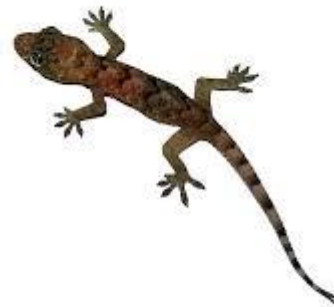
LAGARTIXA - Lizard