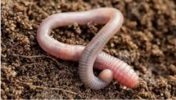
MINHOCA - Worm