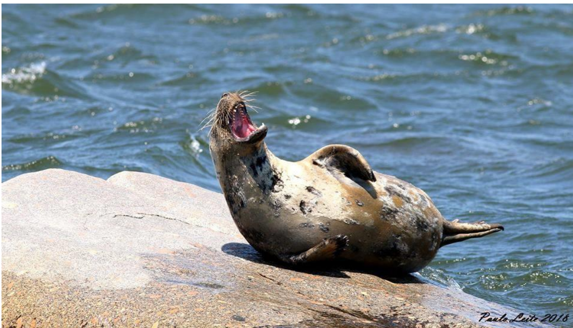
FOCA - Seal