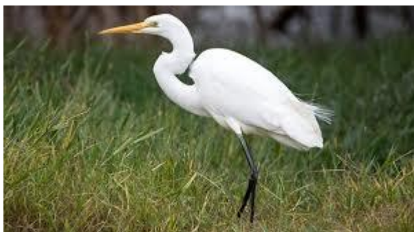
GARÇA - Heron