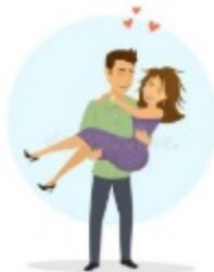
Illustration by [unreadable] for [unreadable]

www.gutenberg.org/files/49848/49848-h/49848-h.htm