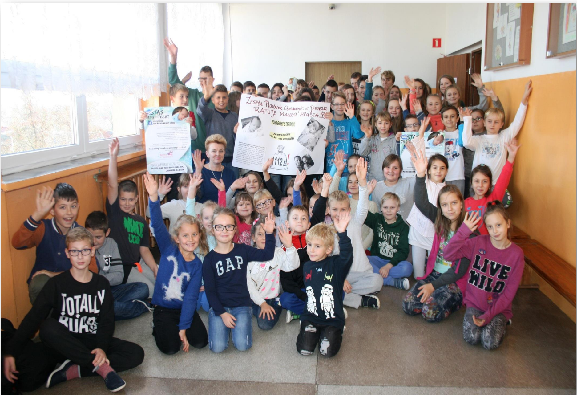
Collection of money for the foreign operation of little Staś from the Świętokrzyskie province