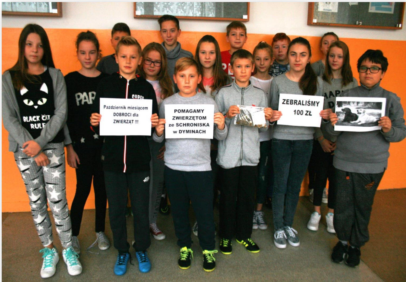
Money collection for a Dog Shelter

We organize charity events such as: money collection for dogs from shelters for homeless animals in Dyminy, collection of plastic caps for foundations supporting sick children, fundraising for treating sick children, collection of stuffed animals for children from orphanages and many more.