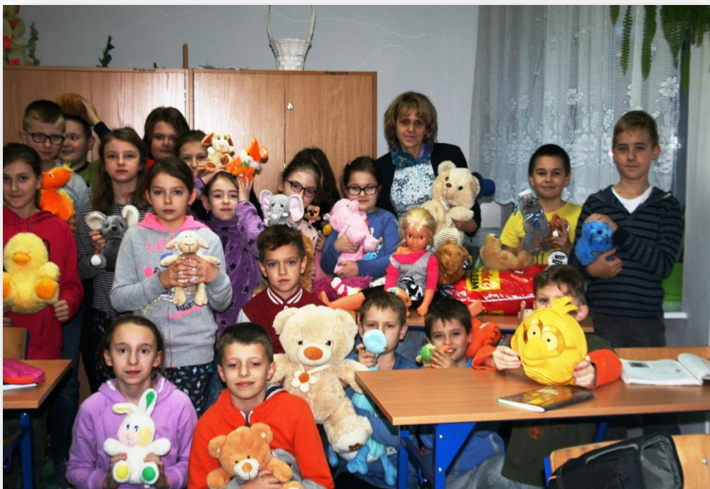
School action of collecting stuffed animals for children from orphanages