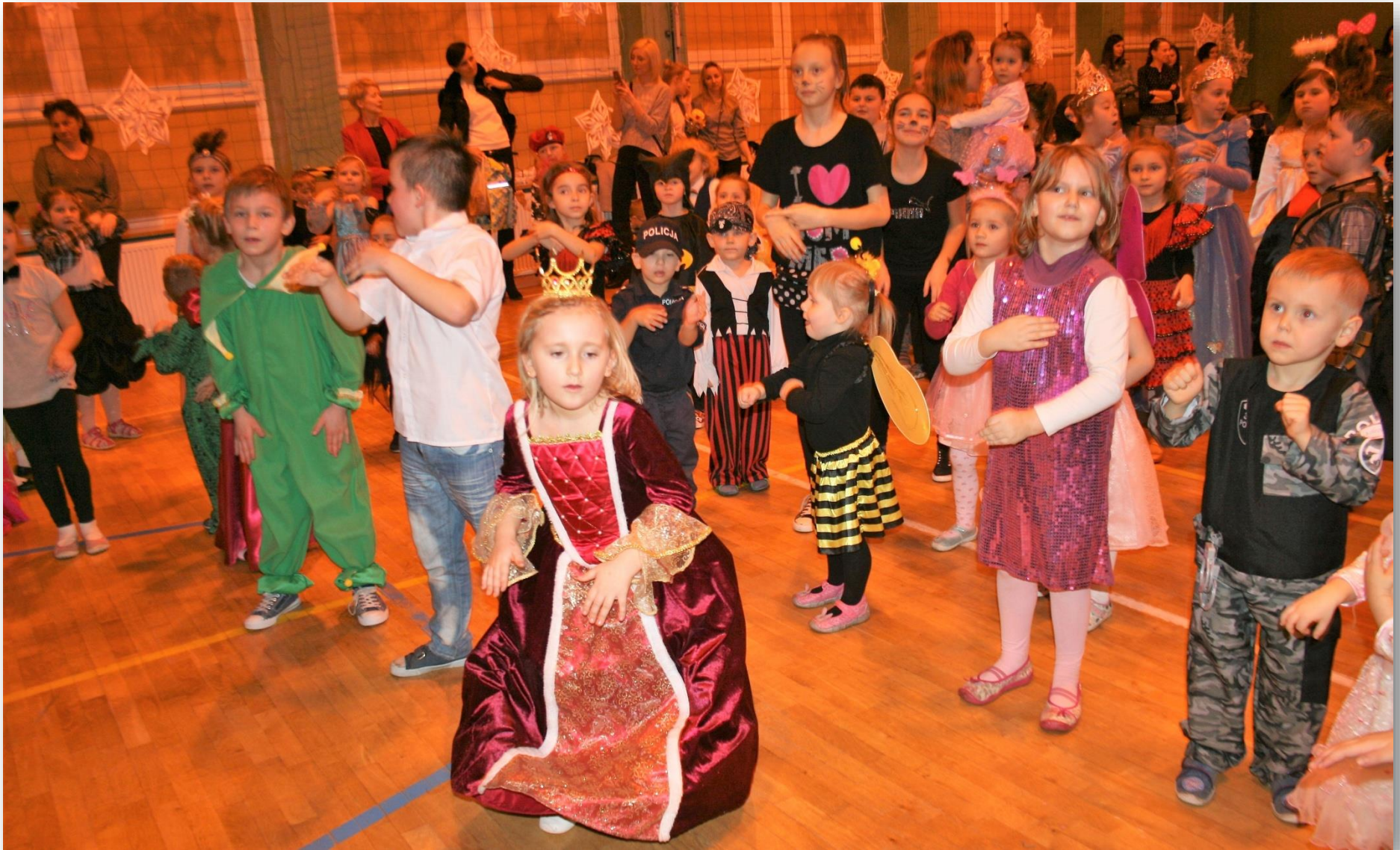
Christmas tree play of the youngest children in school