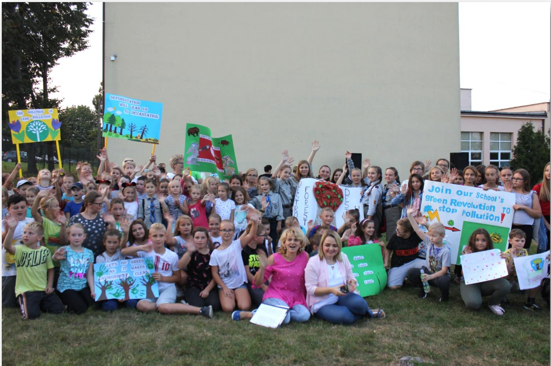
The students presented their ecological slogans in English as part of the ERASMUS + project