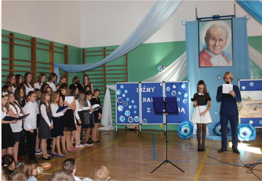
Feast of patron of the school of John Paul II

Students of our school together with teachers prepare for the whole school community academies dedicated to patriotic holidays, the patron saint of the school of John Paul II, Christmas Christmas, National Day, Women's Day, Grandmother and Grandfather Day, Mother's Day, World Earth Day, etc.