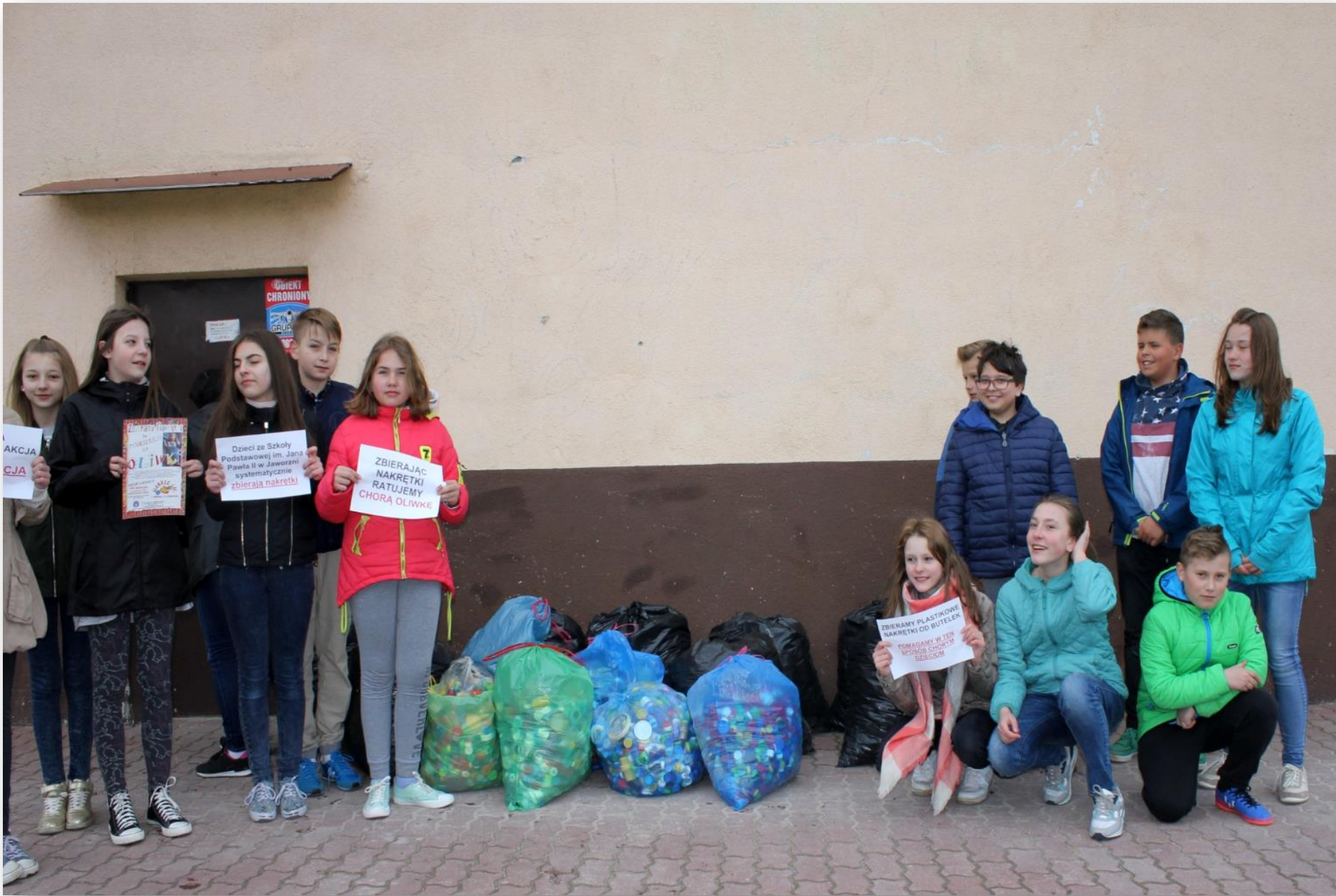
Collection of plastic caps