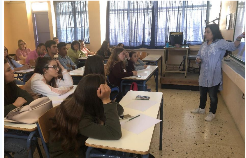
Greek Language Lesson