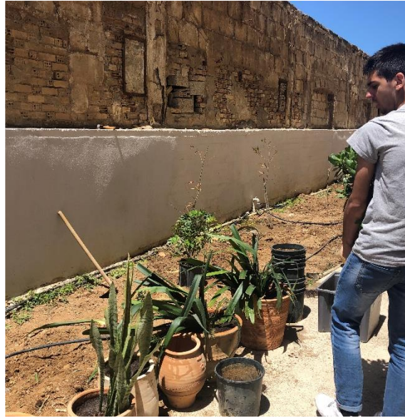
Planting and gardening in the school yard