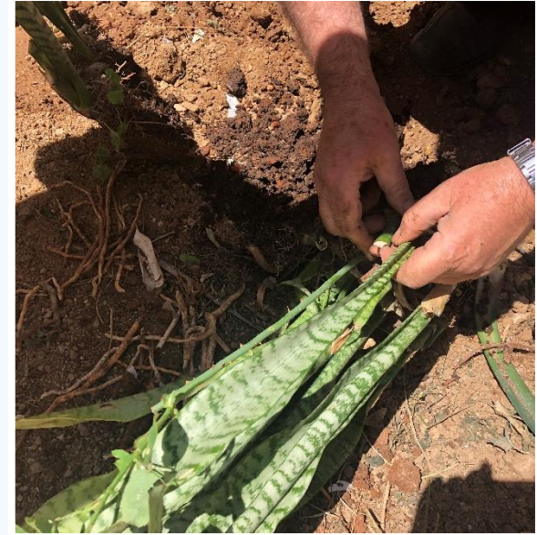
Planting and gardening in the school yard