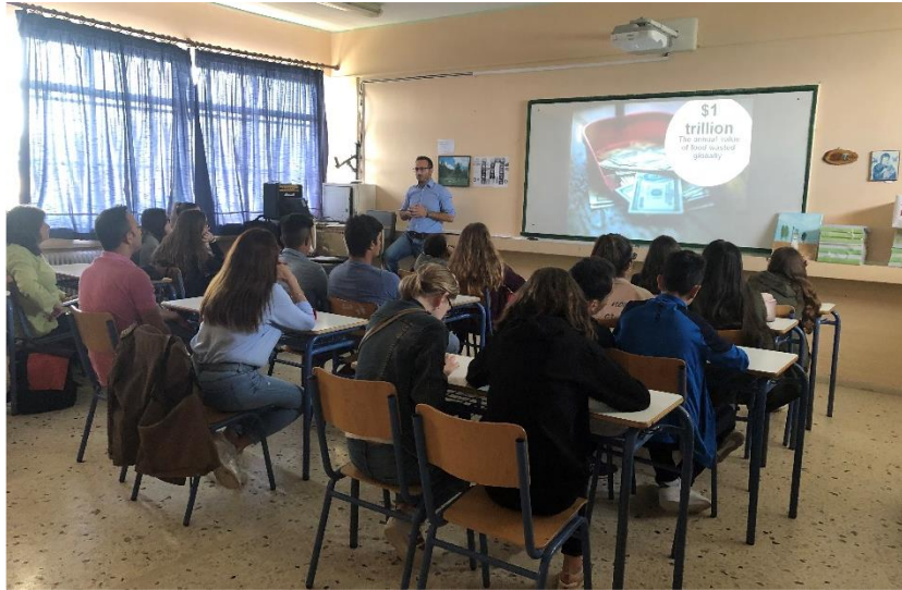
The recovery of waste by using composting