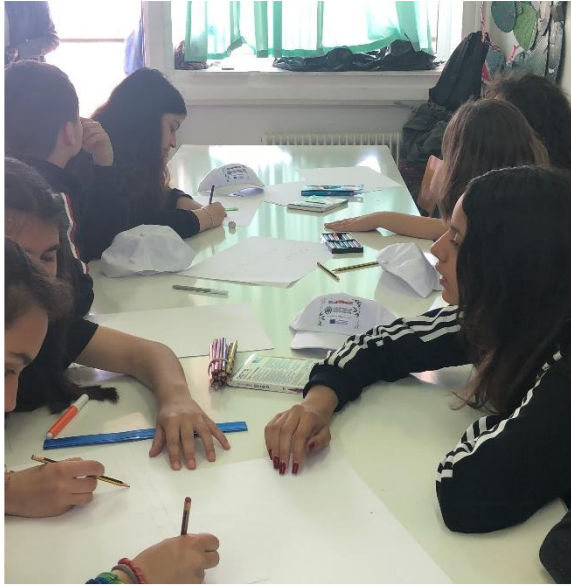
Stop Vandalism Campaign, Create a Poster