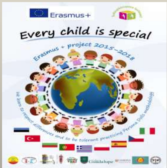
Erasmus+ project, 2015 – 2018 “Every child is special”