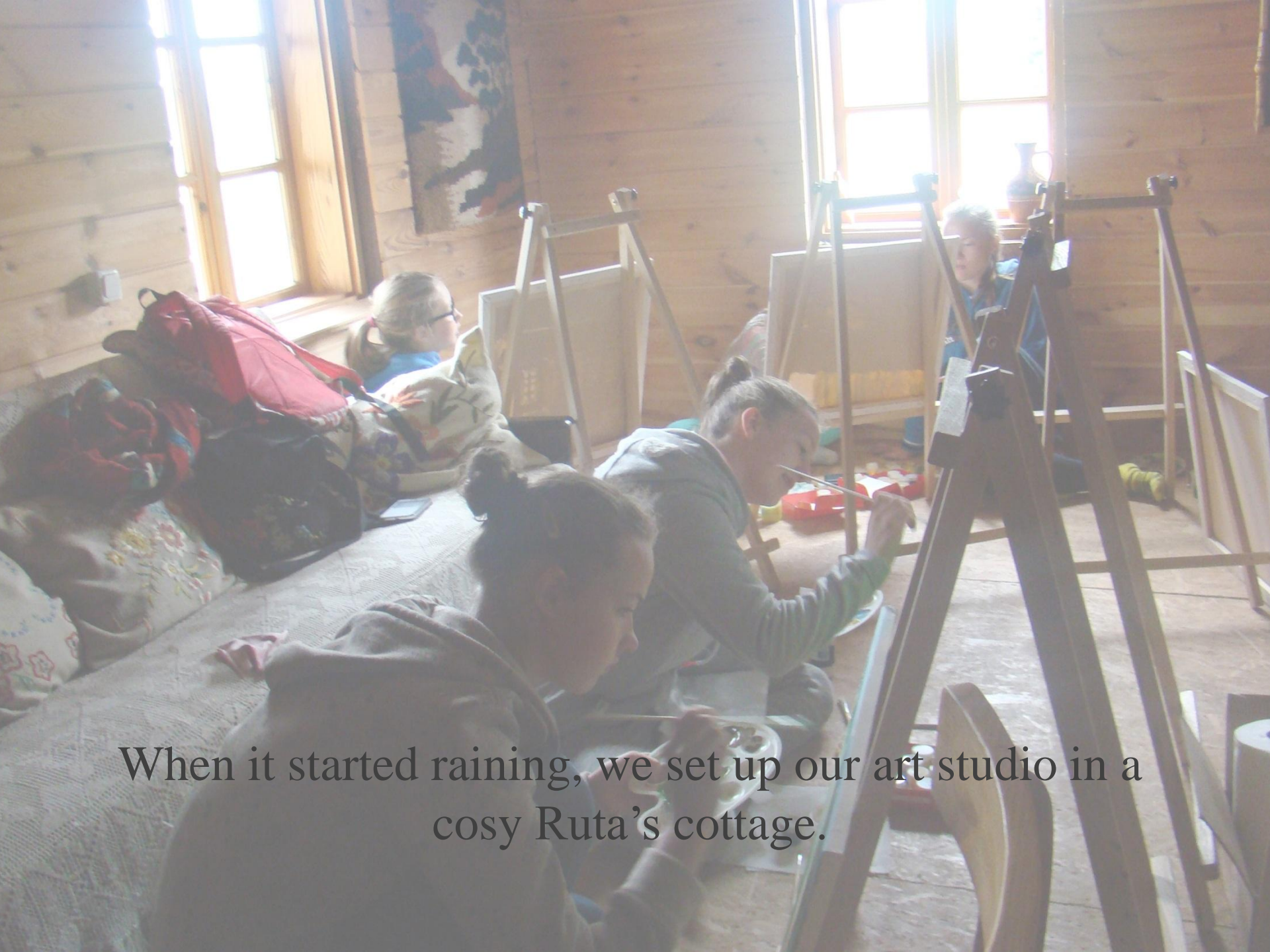
When it started raining, we set up our art studio in a cosy Ruta's cottage.