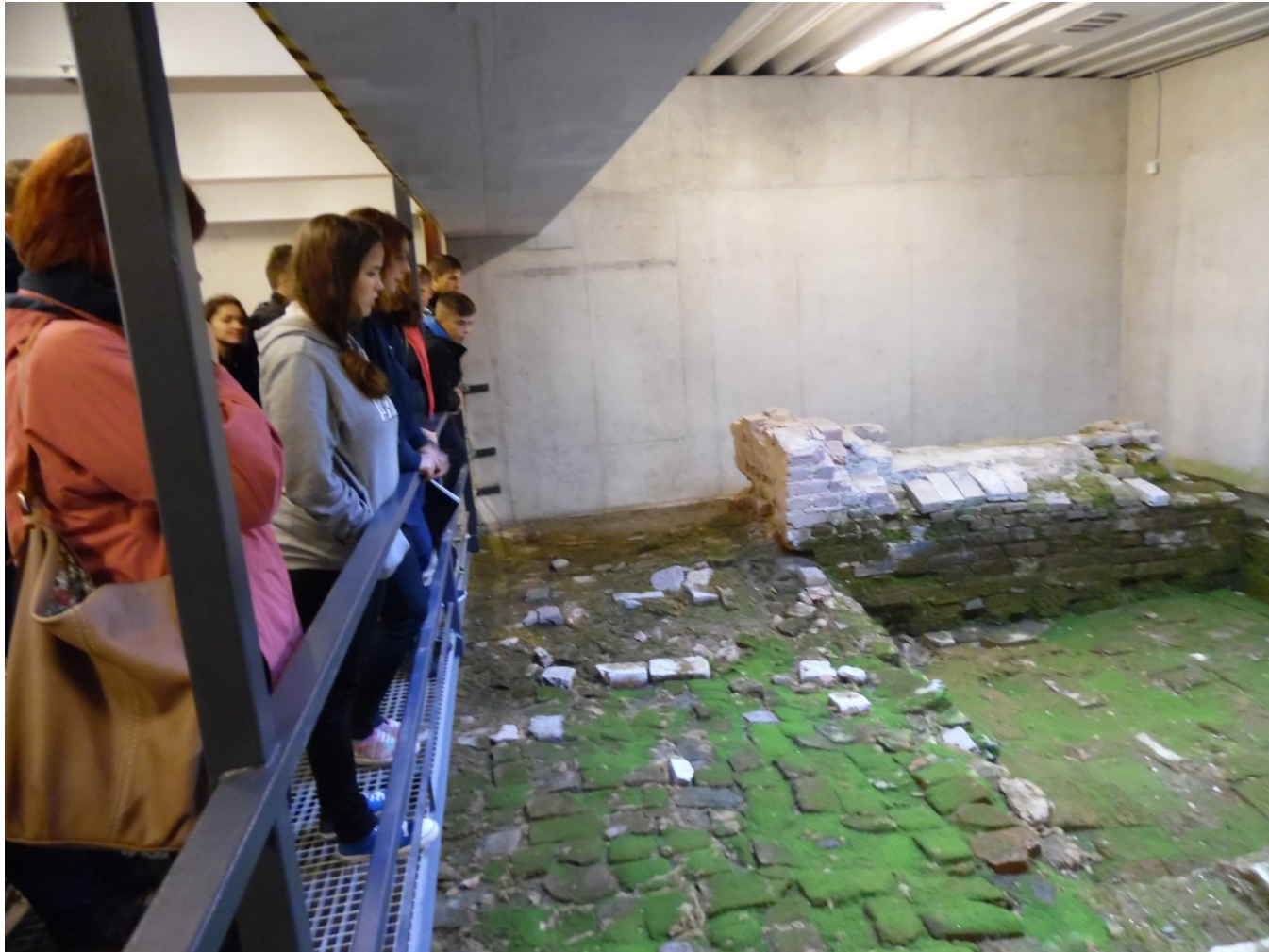
Students see the discovered fragments of Radvilos' palace