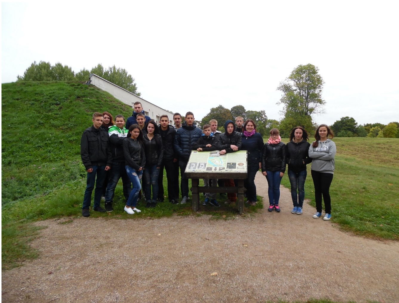
Radvilos' castle site