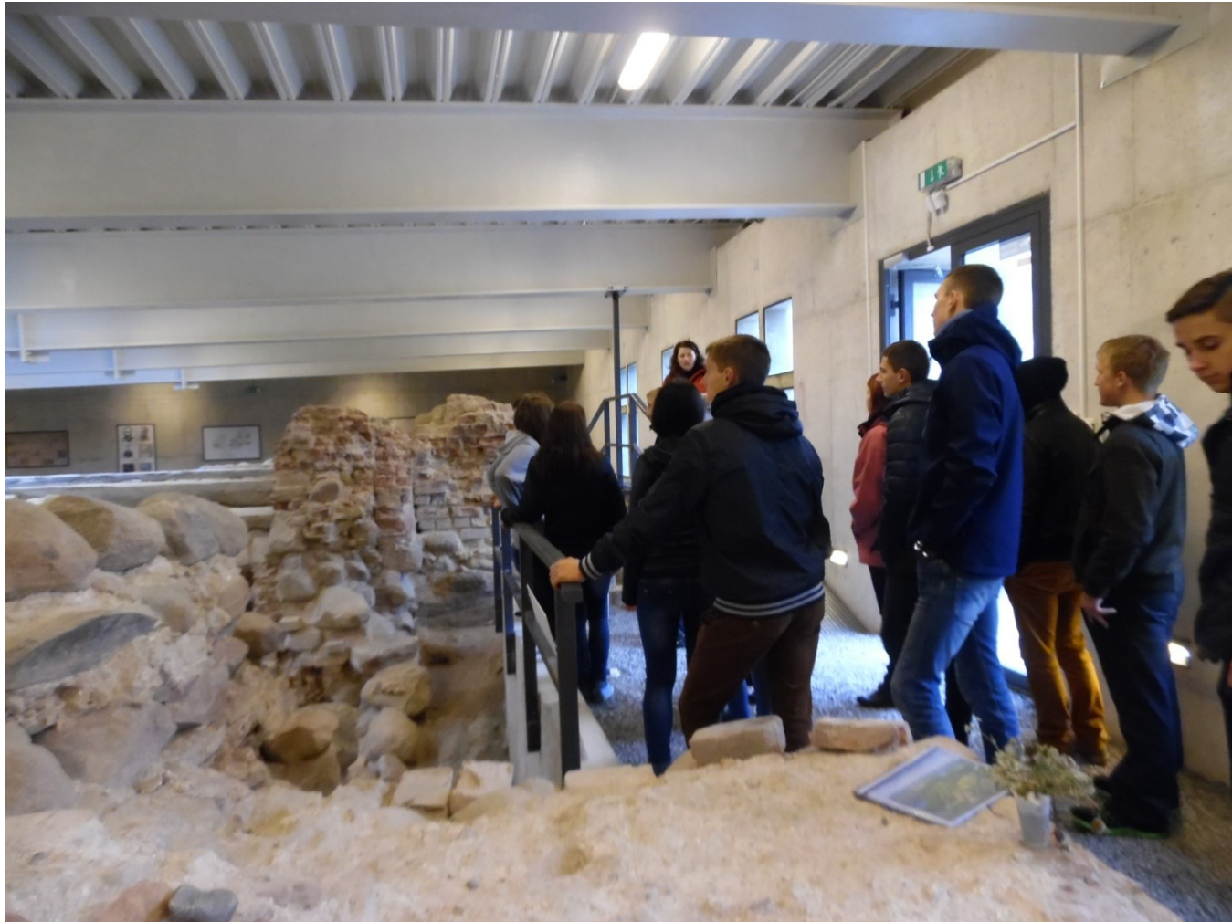
The exposition of Radvilos' palace ruins