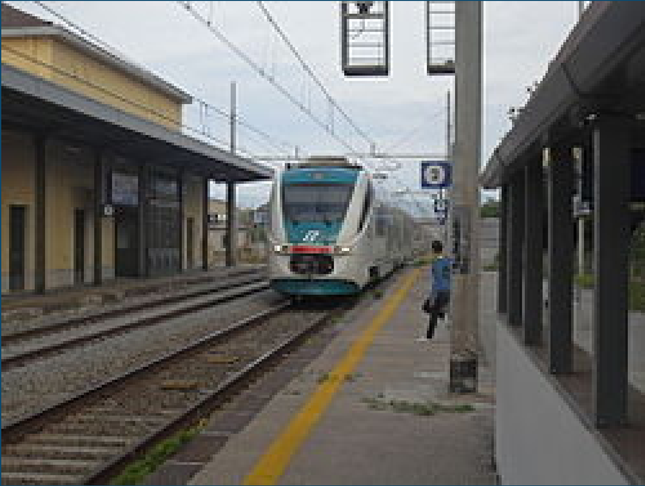
The station in Bellizzi and the Entrance of our school