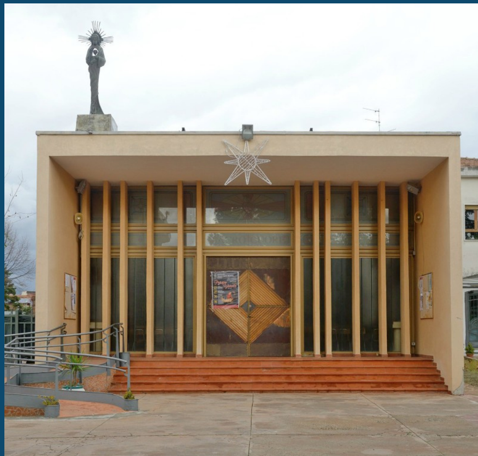
The church in Bellizzi; The seat of Town Hall

SO I AND AMIN RECOMMEND THAT YOU VISIT BELLIZZI REALLY SOON, BYE BYE.