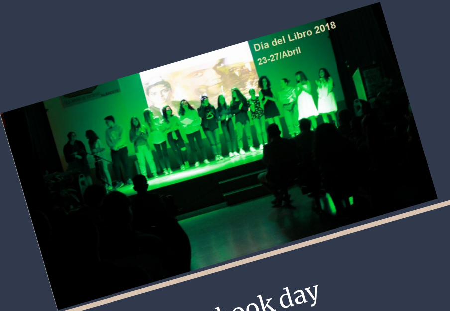
The book day