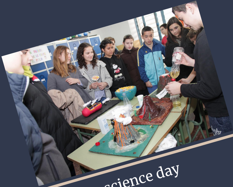
The science day