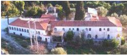
St. Nicolas Monastery

7. St. Nicolas Lemonia Historic Monastery 17th c. – St.John Kalivitis Chapel 10th c. Situated in a pine tree forest, south of the island towards Kanakia.