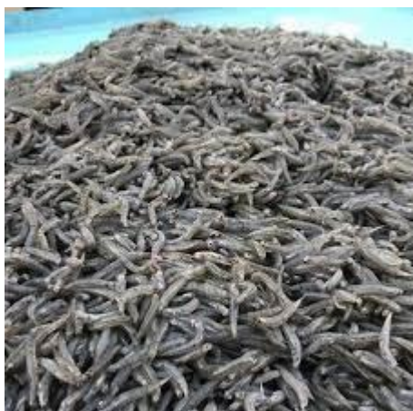
Bichique: small fish threatened by overexploitation