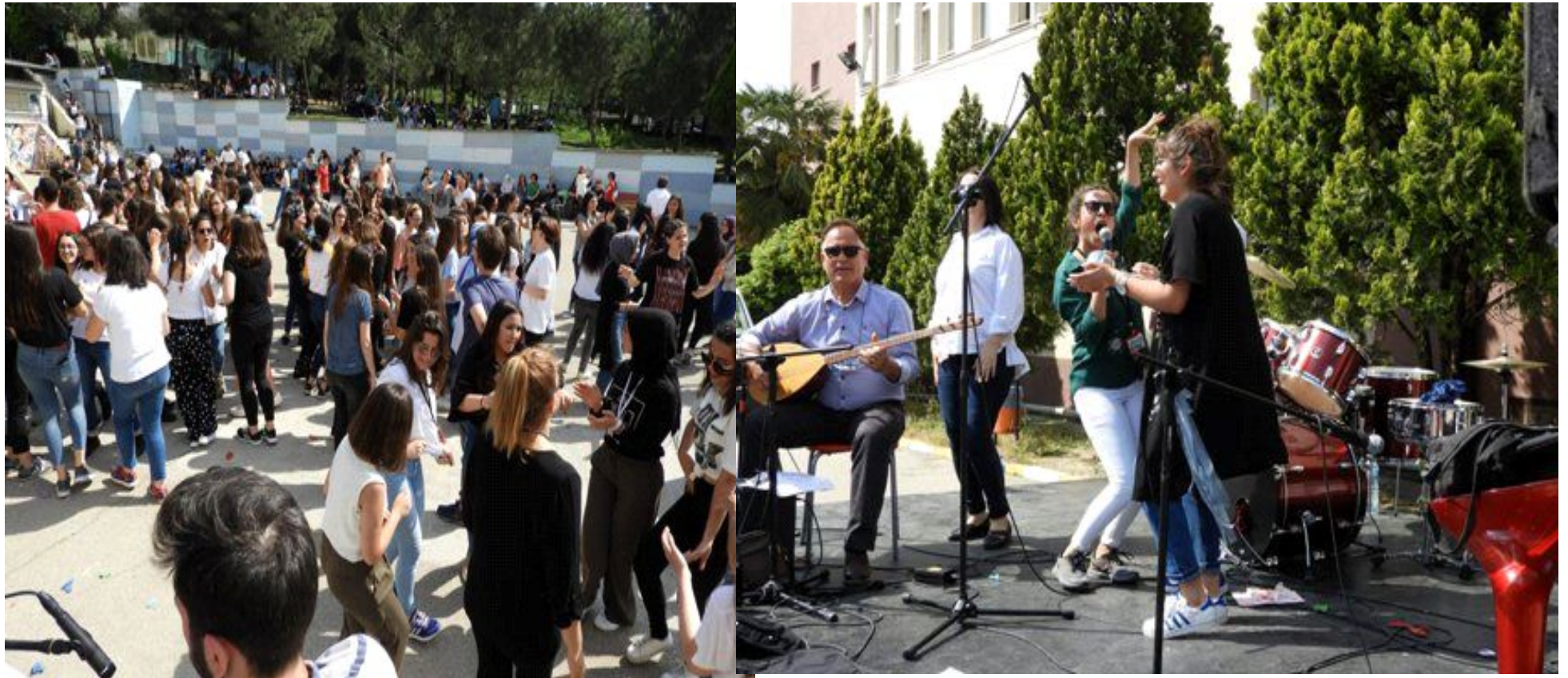
The students are celebrating ‘ The Spring Day’