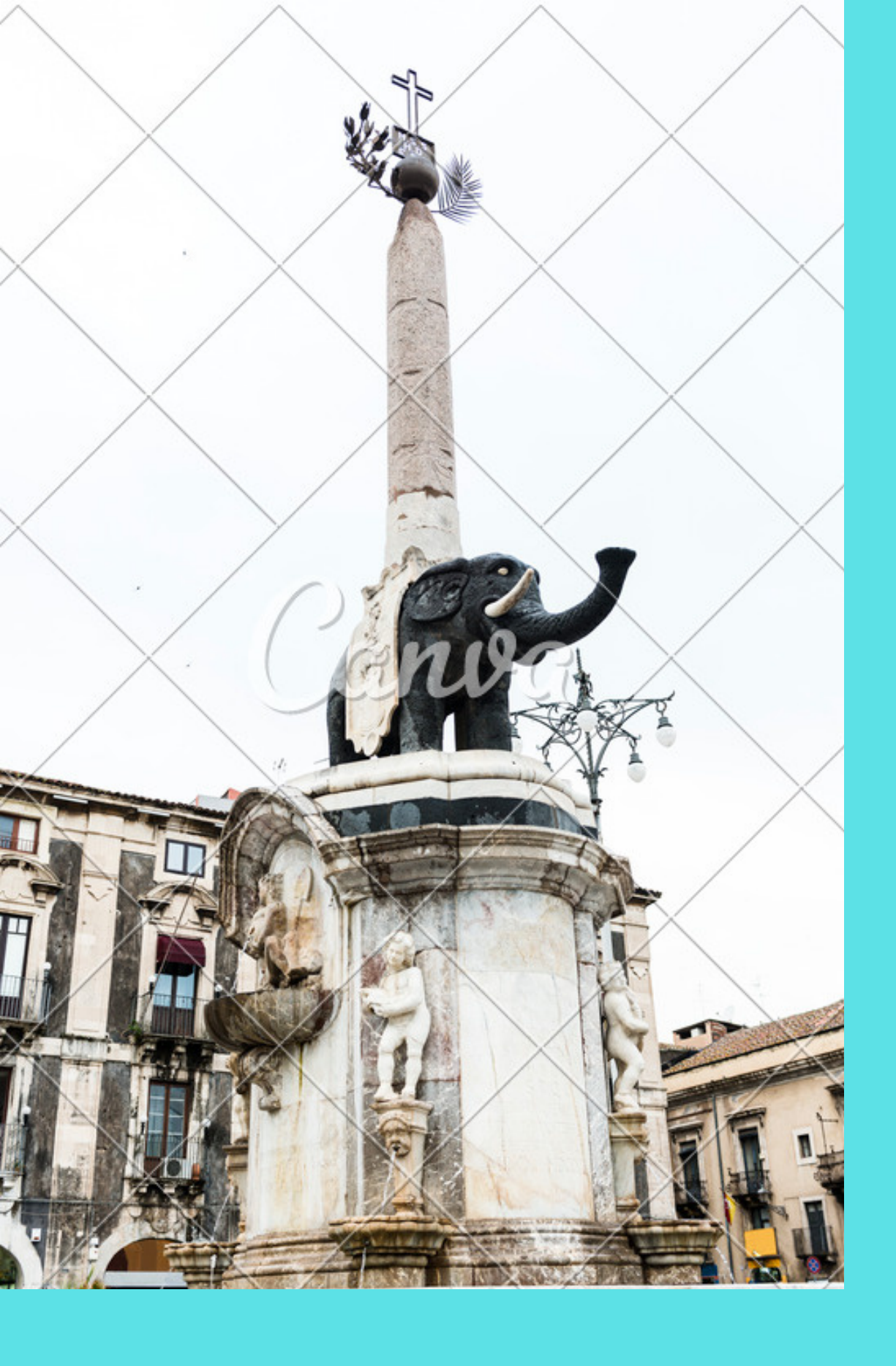
The symbol of my town is the elephant statue(Liotro)