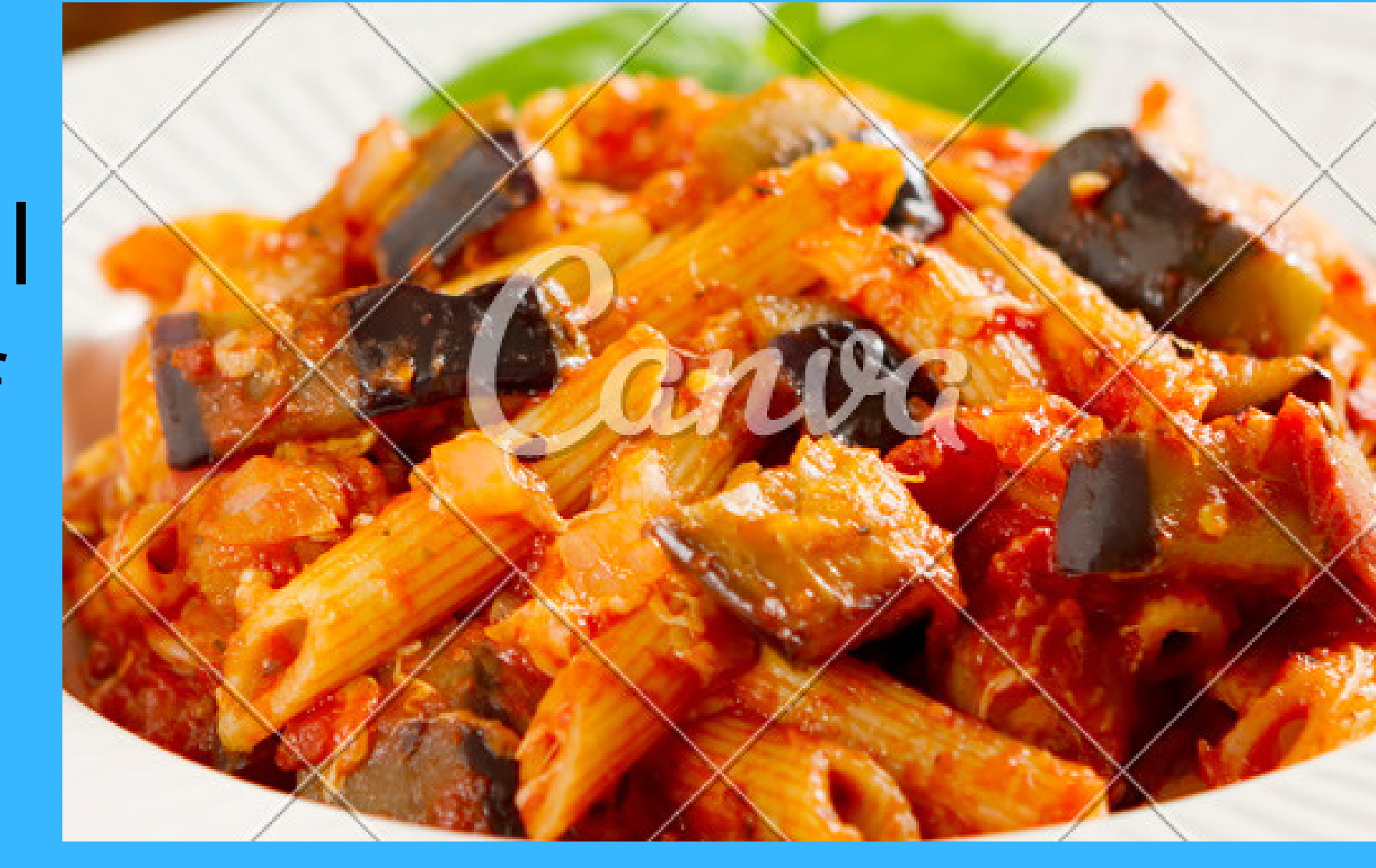
pasta alla norma