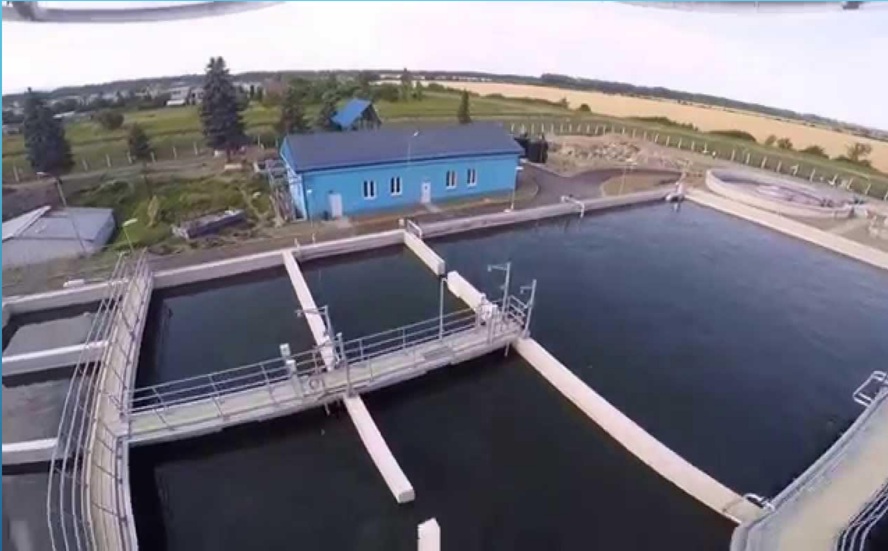
A WATER PURIFIER (CLEANER) THAT CLEANS WATER FOR OUR VILLAGE