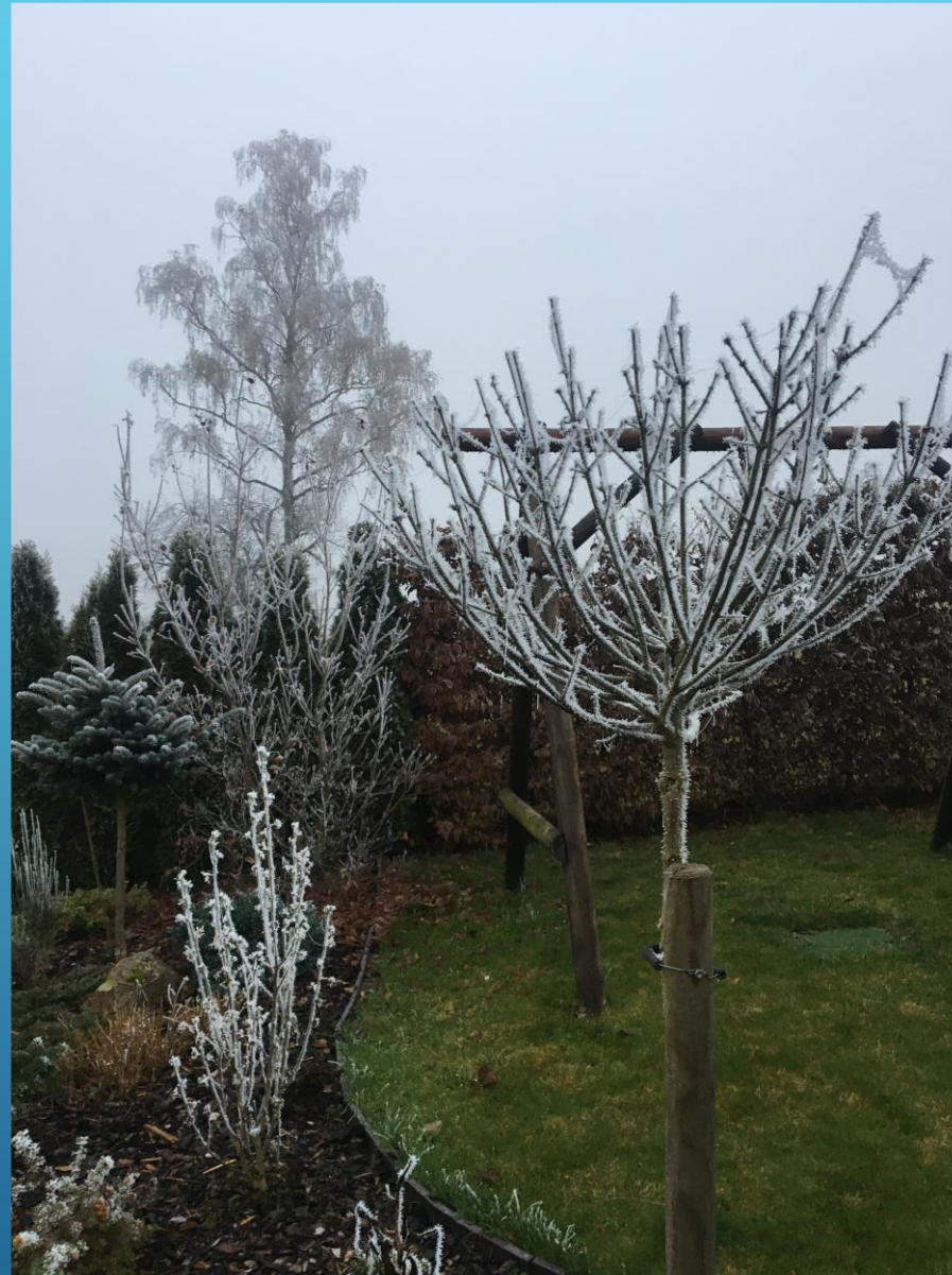
THE FROZEN LEAF OF BIRCH