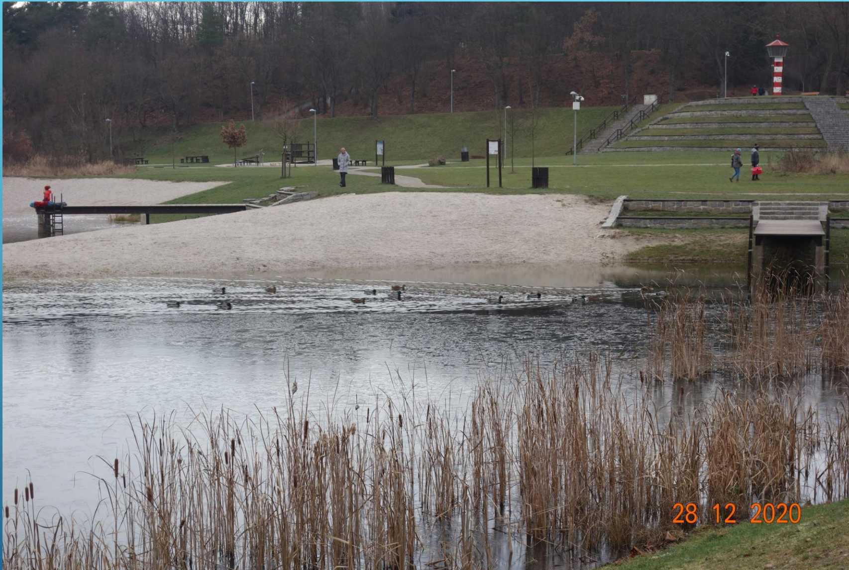
PARK IN PILSEN - 2