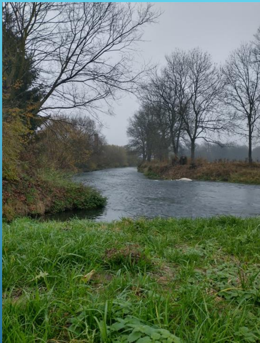
THE RIVER ÚSLAVA IN PŘEŠTICE