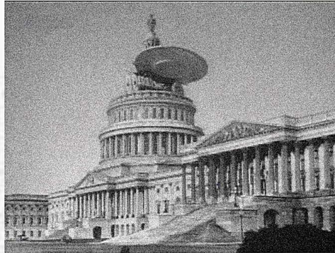
Dramatic images coming from Washington DC

If you believe you have seen an Alien don't approach it. Back away and run for help.