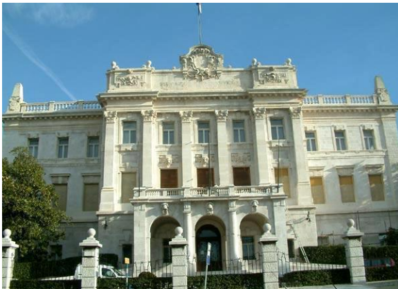
Palace in 2001.