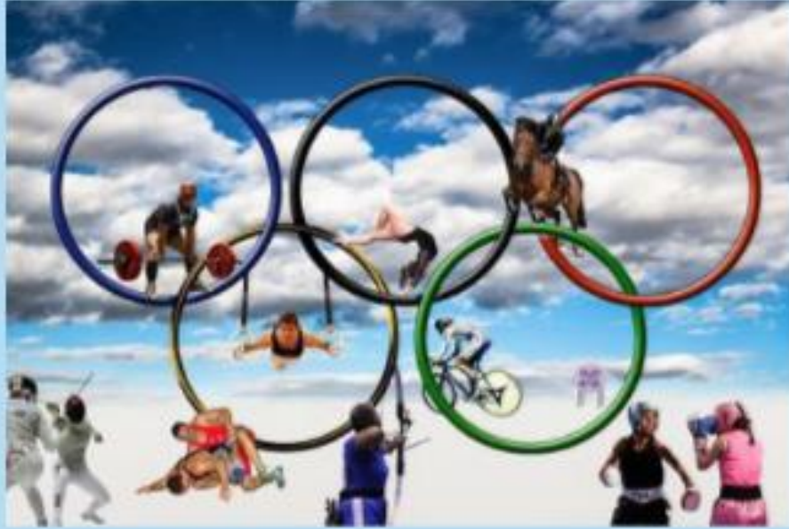
SUMMER OLYMPIC GAMES