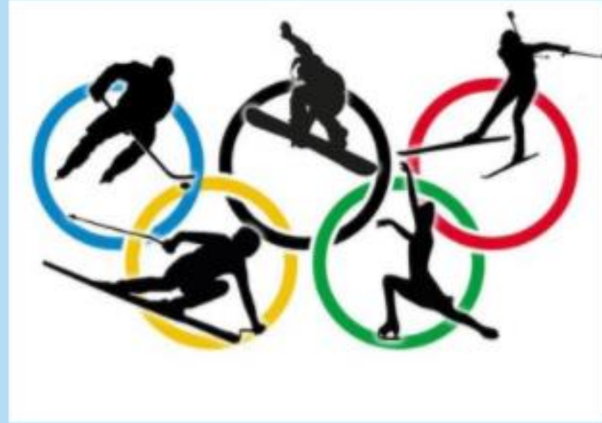
WINTER OLYMPIC GAMES