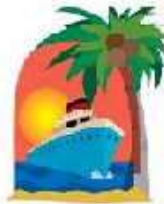
V o y a g e