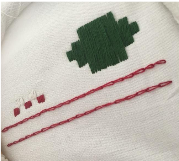
In the process...

The mask was done and ready for the exhibition. :)