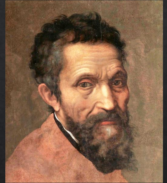
-picture of Michelangelo