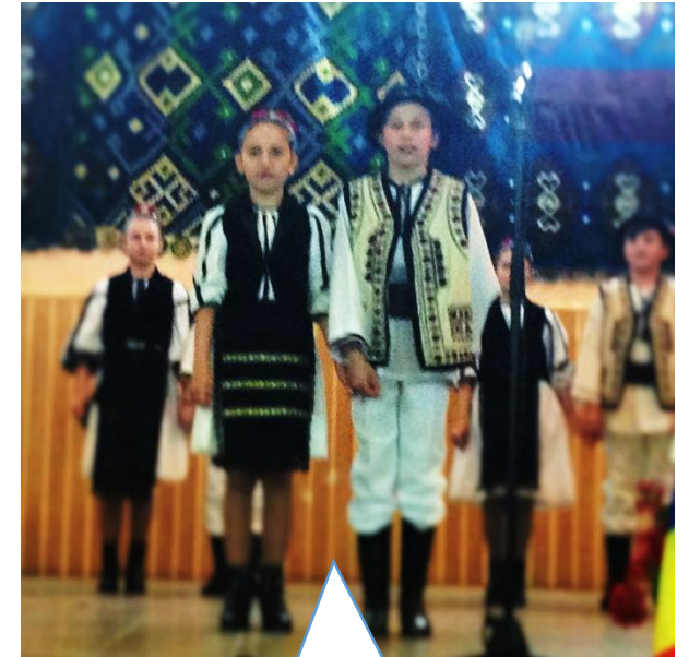
Folk evening with traditional songs and dances prepared by local folklore groups.