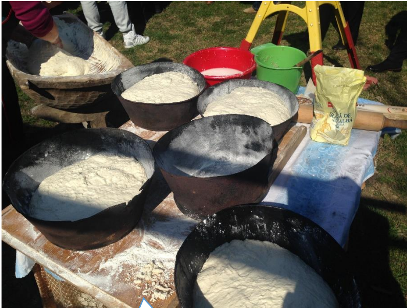
Preparation and baking of traditional white bread.