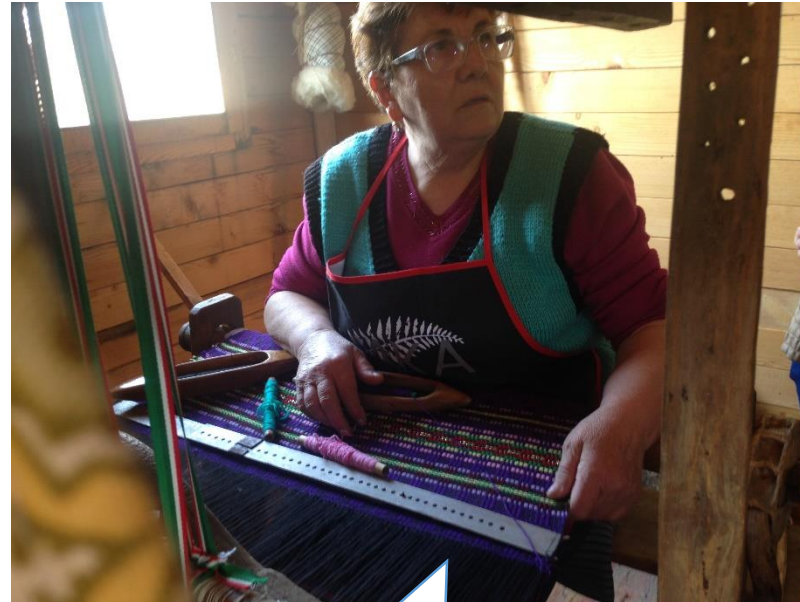
Folk costume making in the loom.