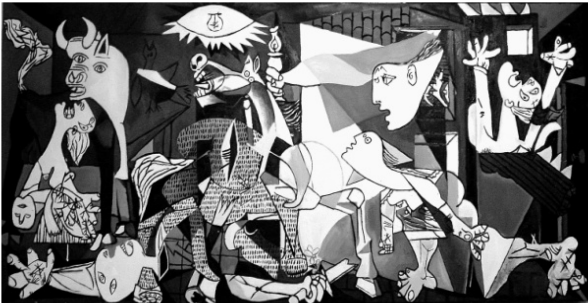
Pablo Picasso, Guernica

Pablo Picasso was born in Malaga, Spain , 1881. In 1901 he moved to Barcelona and later Paris , which he found to be the ideal place to practice new styles, and experiment with a variety of art forms.