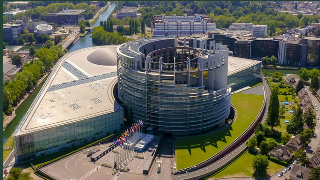
the European Parliament