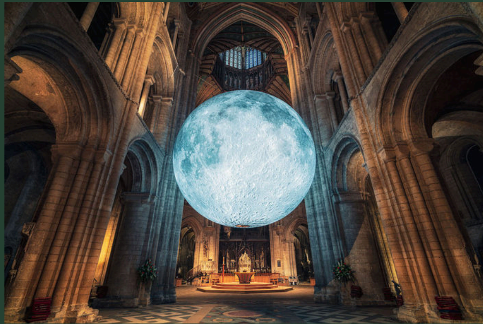
Museum of the moon by cosmos District