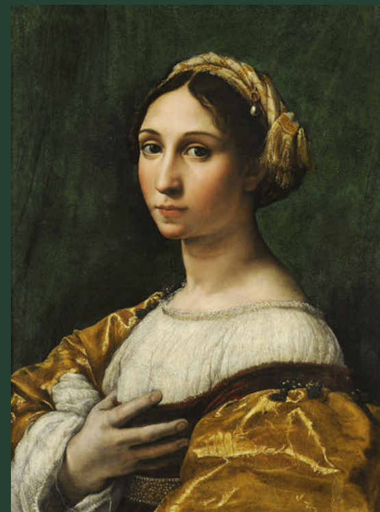
PORTRAIT OF A YOUNG WOMAN by Raphaëlo