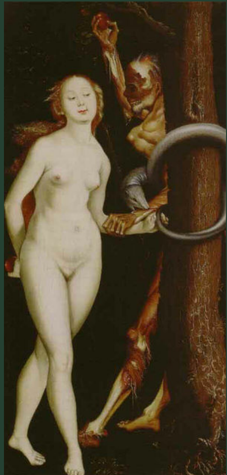
« Ève , the snake of death » by Baldung Grien