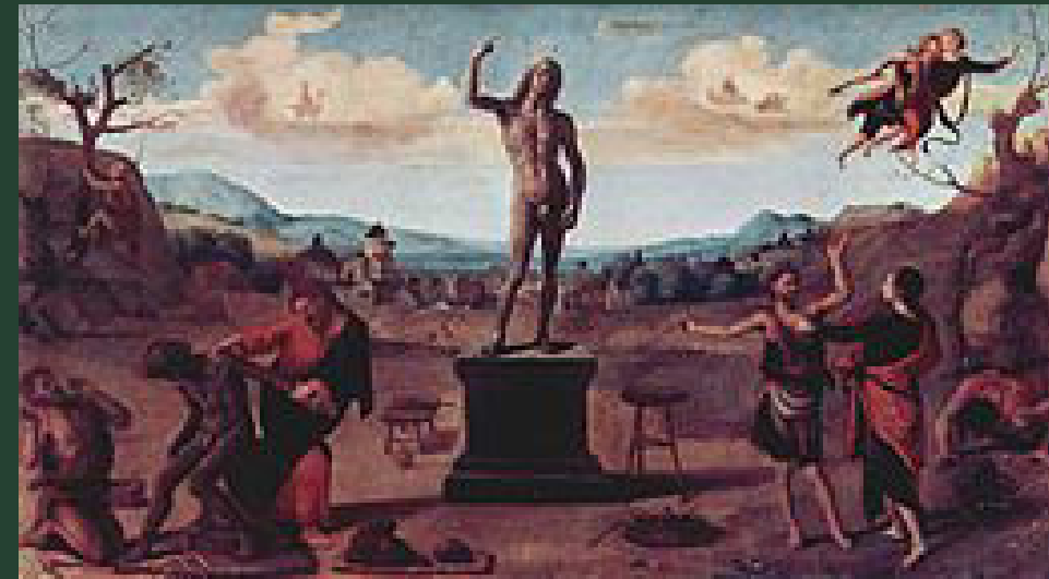
Mythological painting By Piero di Cosimo « history of promothé »