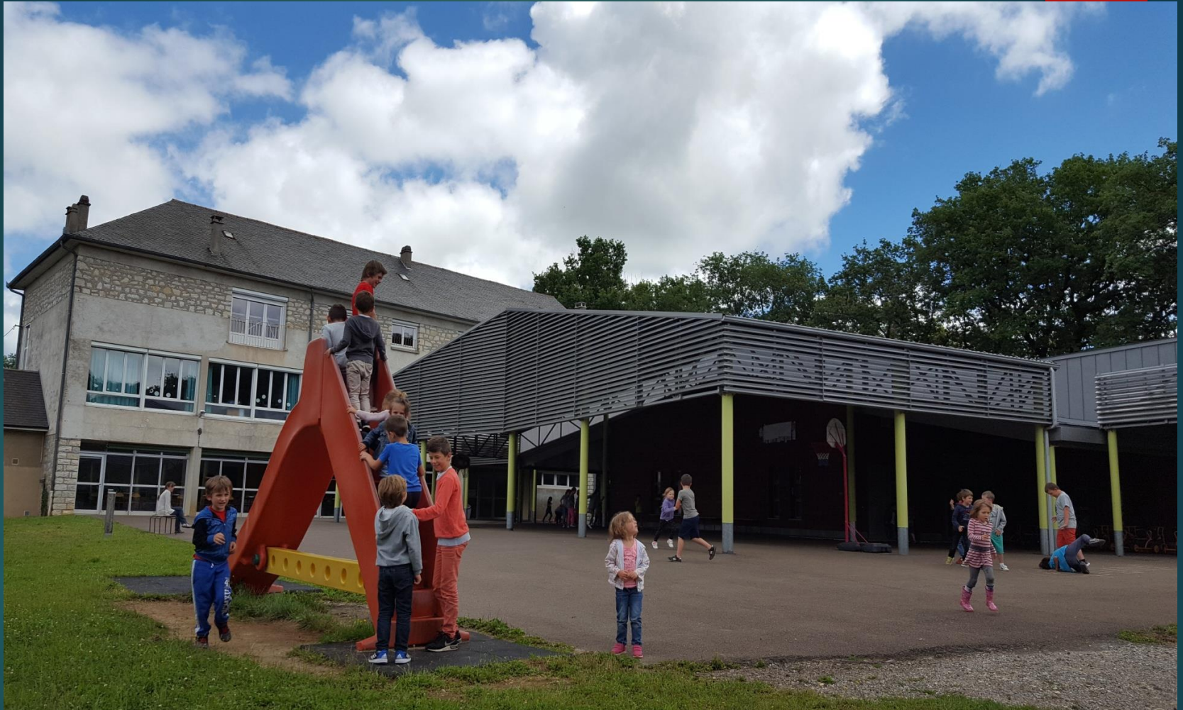
The playground and school buildings