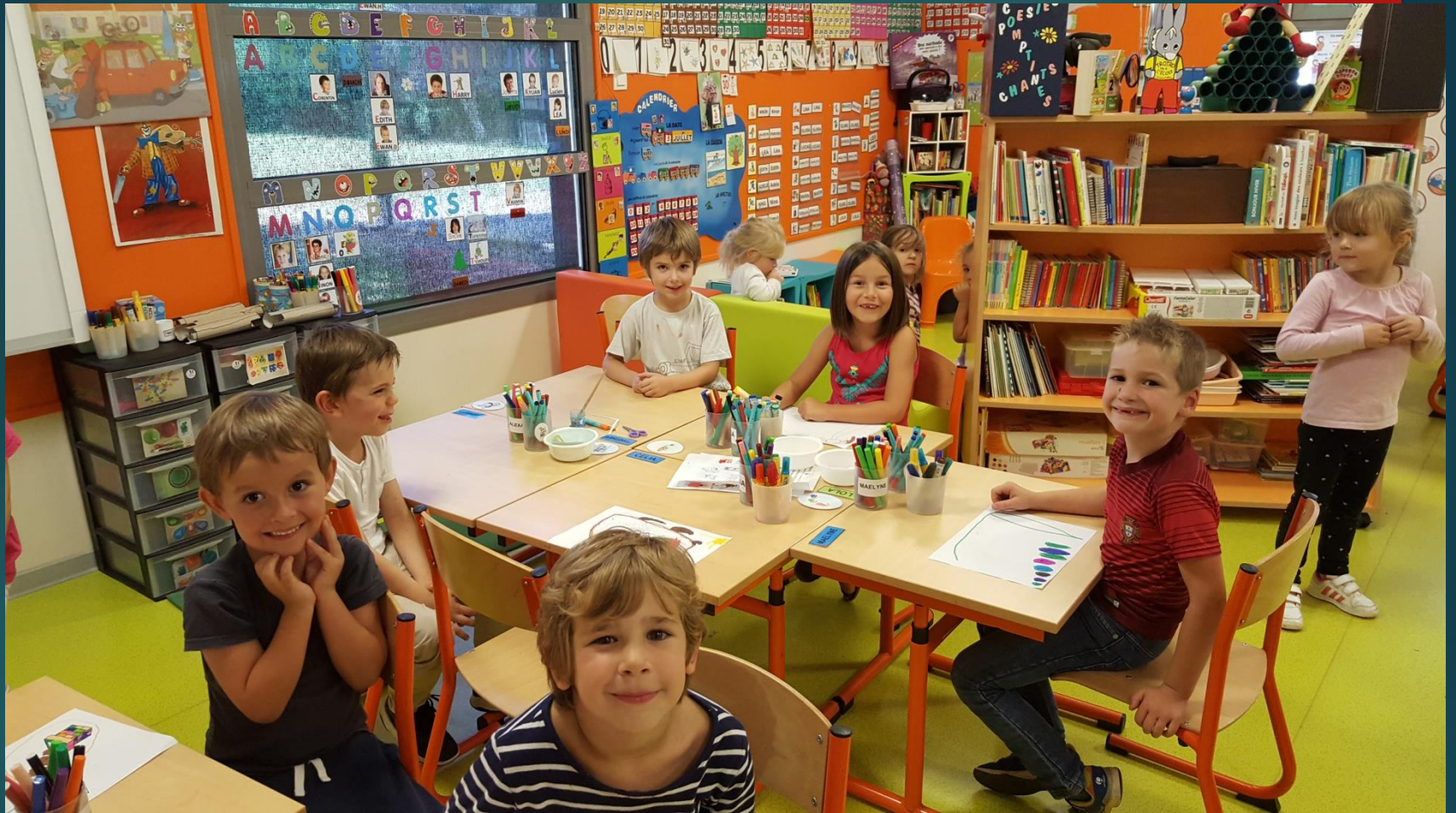
The kindergarten and infants class