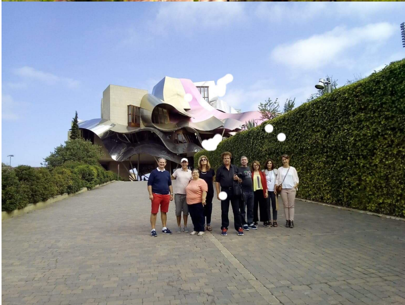
ElCiego with this huge hotel designed by the architect Franck Ghery