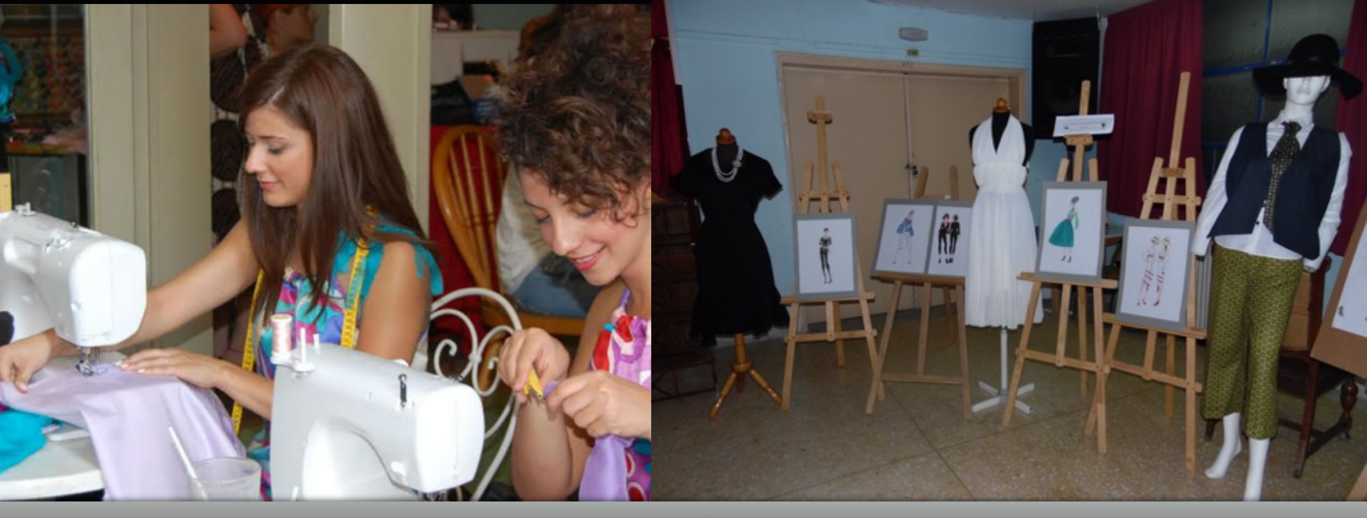
Fashion Design and Garment Production