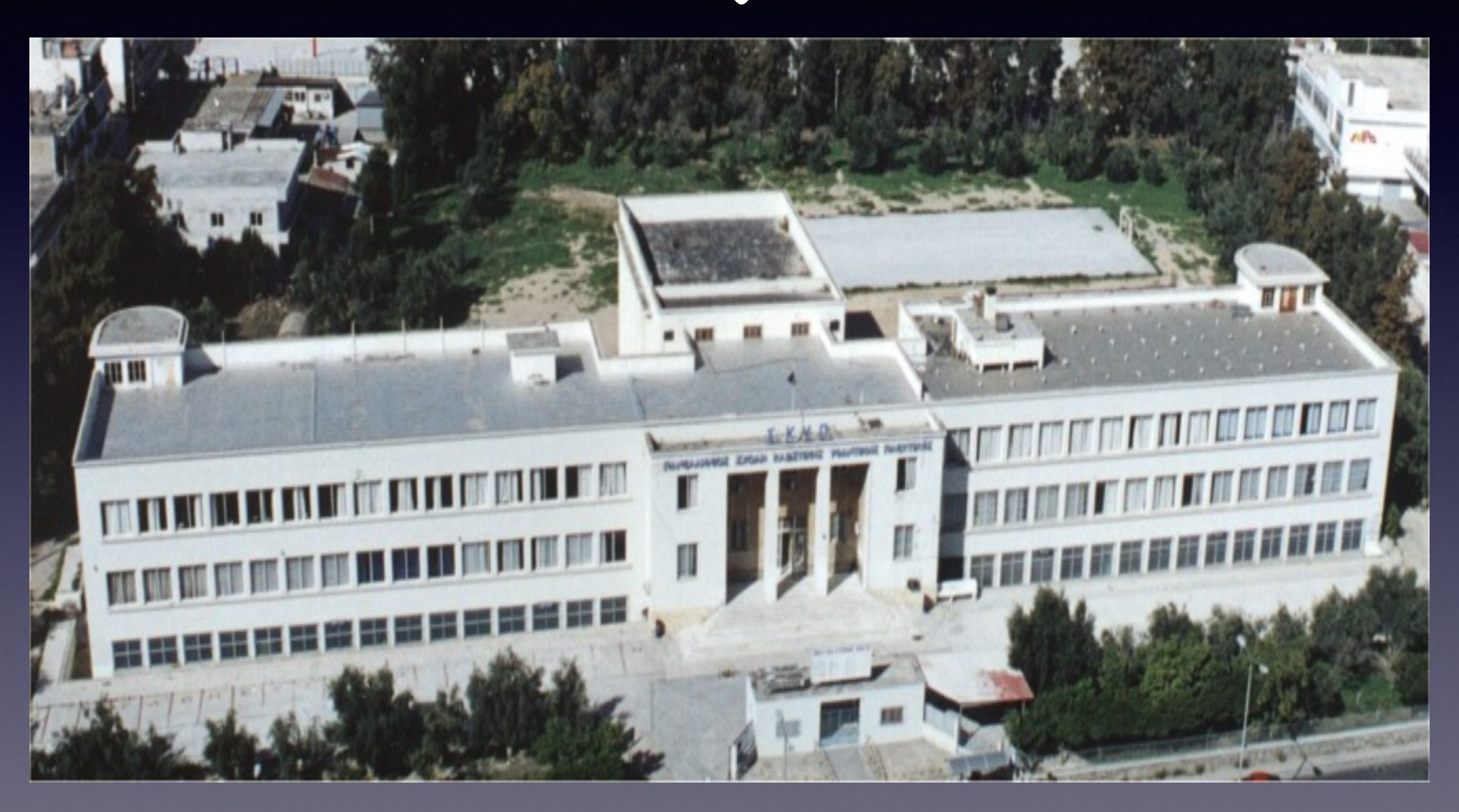
E.K. = Laboratory Center