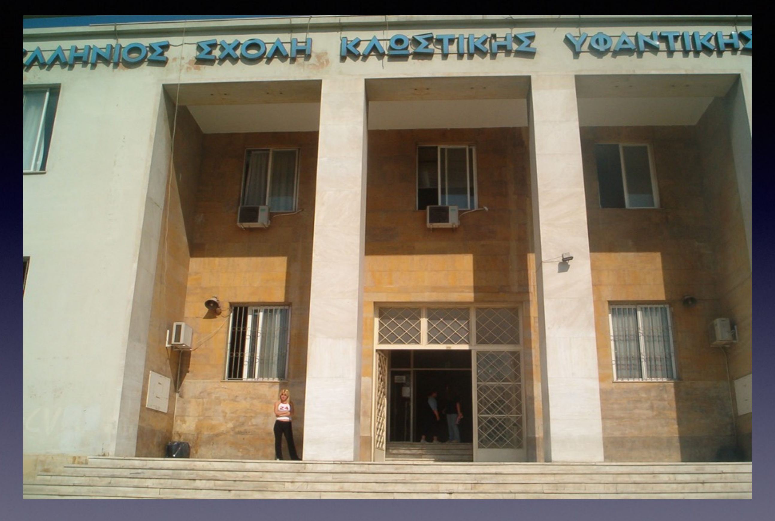
The Main Entrance