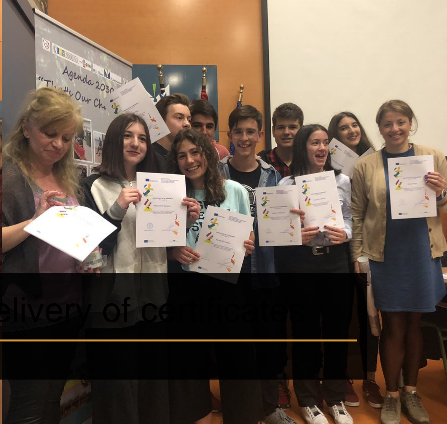
the delivery of certificates