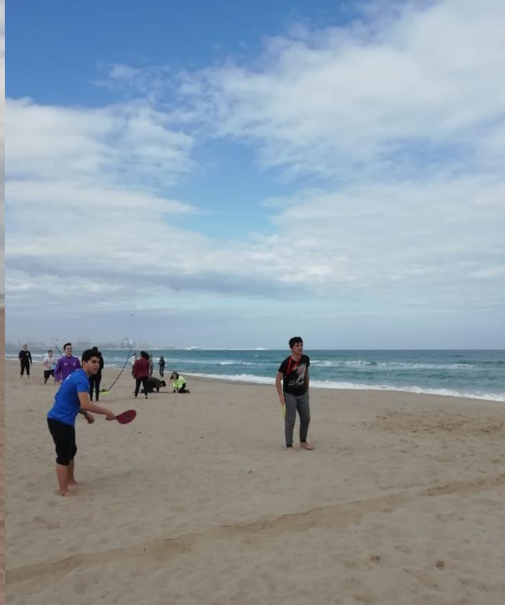
♥The Greek team♥