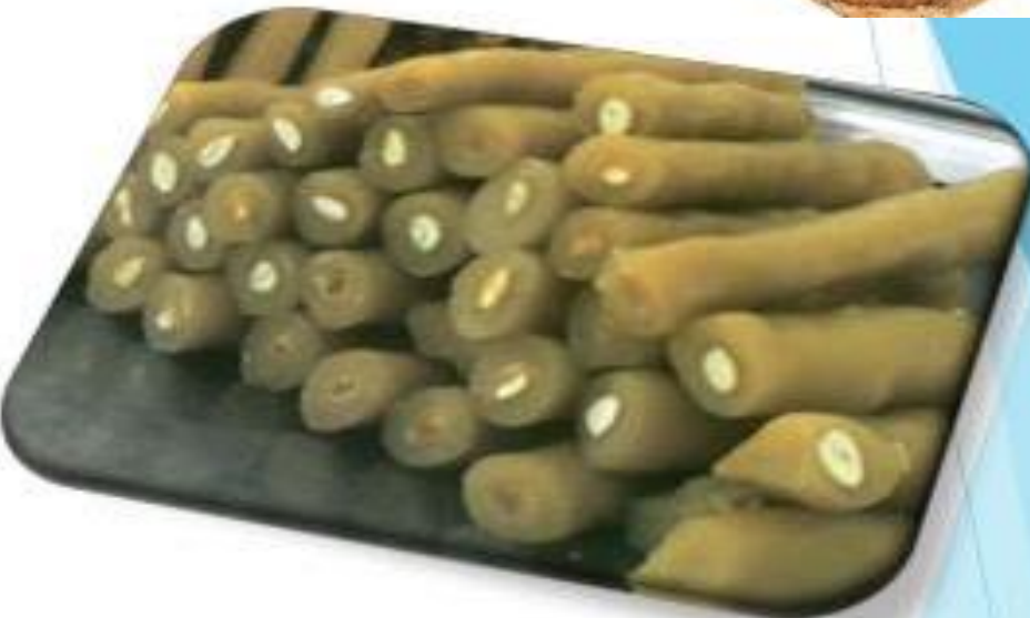
Traditional sweets made from grapes