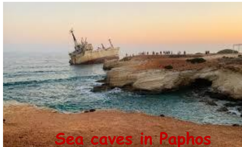
Sea caves in Paphos