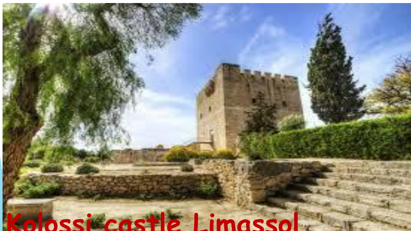
Kolossi castle Limassol