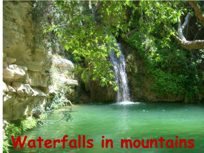
Waterfalls in mountains