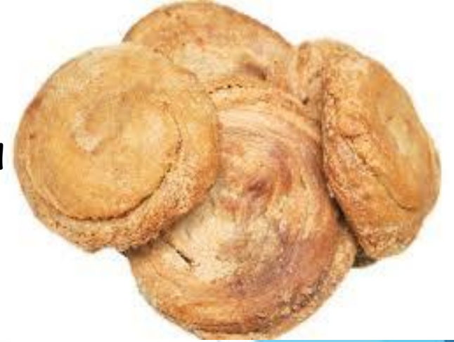
Tahini pie is a Cypriot delicacy made of pastry and tahini made of sesame seeds and sugar