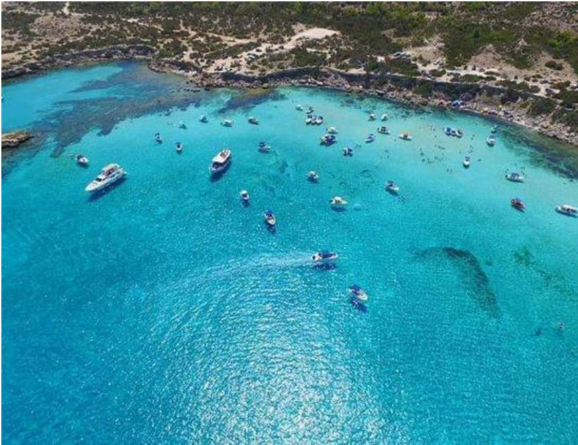
Blue lagoon Akamas