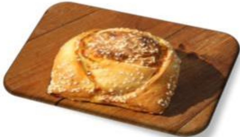
Easter, Cypriot delicacy, consisting of flour and filling special cheese, raisins and mint