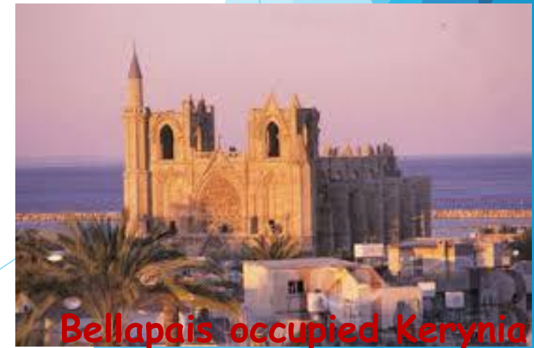
Bellapais occupied Kerynia