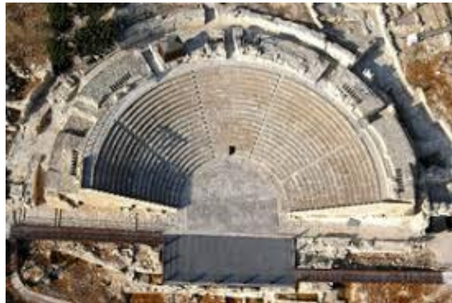
Kourion theatre Limassol