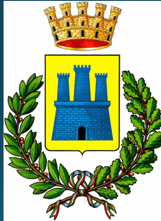
The logo of the town NICOTERA