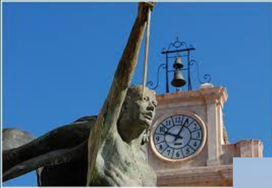
THE CLOCK TOWER