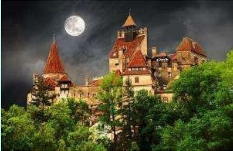
Bran Castle (Dracula's Castle)

Among the fir branches are the enchanted castles.