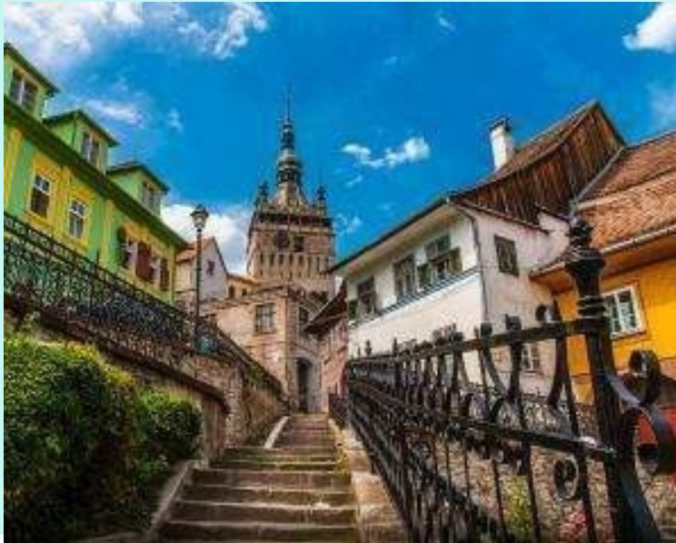
The fortress of Sighisoara