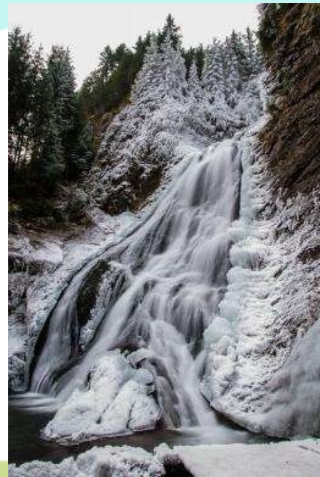
The Wave of the Bride Waterfall