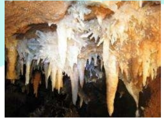
The cave with crystals