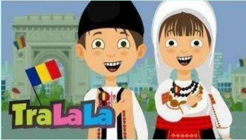
The anthem of Romania