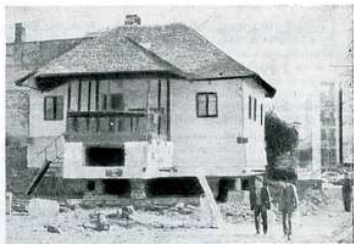
Imagini din timpul mutației monumentului