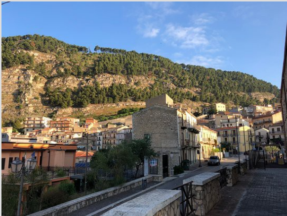
Castronovo of Sicily