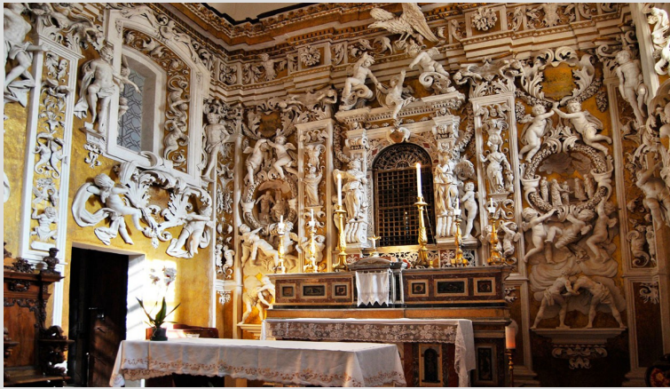
Castelbuono, province of Palermo

The villages open their known and unknown "family jewels" in the mountains and by the sea. They take advantage of local resources, offer visits, tours and experiences in the green.