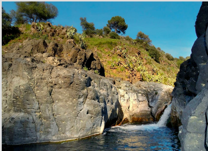
Militello in Val di Catania