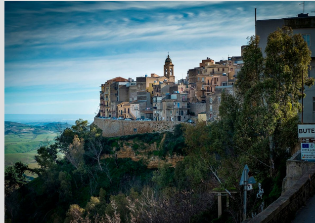
Butera, province of Caltanissetta