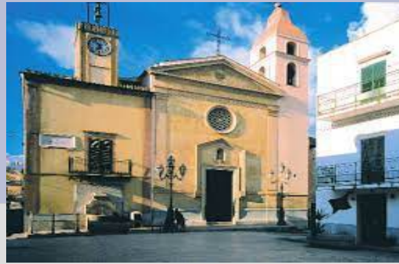
Santa Cristina Gela, Piana degli Albanesi