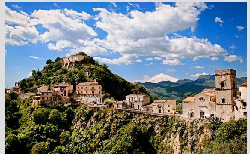
Savoca, province of Messina