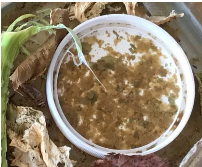
some fish flakes