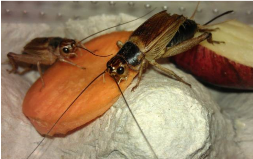
a piece of carrot