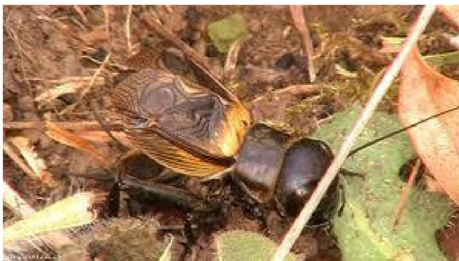
The sing of the cricket

https://www.youtube.com/watch?v=EHEYBP_06cM