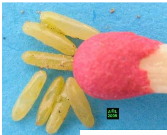
Several crickets eggs