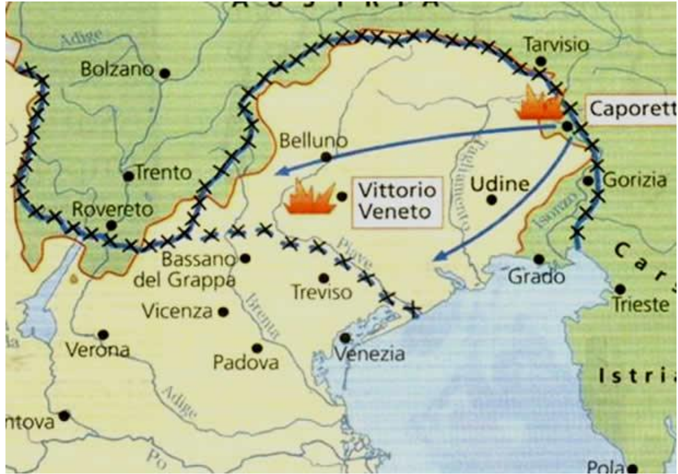
MAP OF ITALIAN FRONT that was expanding all over the Alps