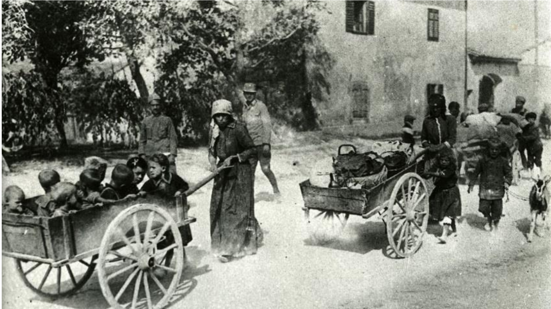
The war refugees from immigration camps