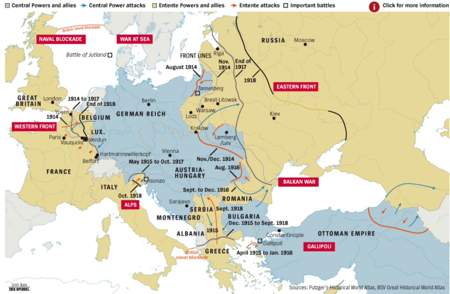
MAP OF FRONTS DURING 1st WORLD WAR