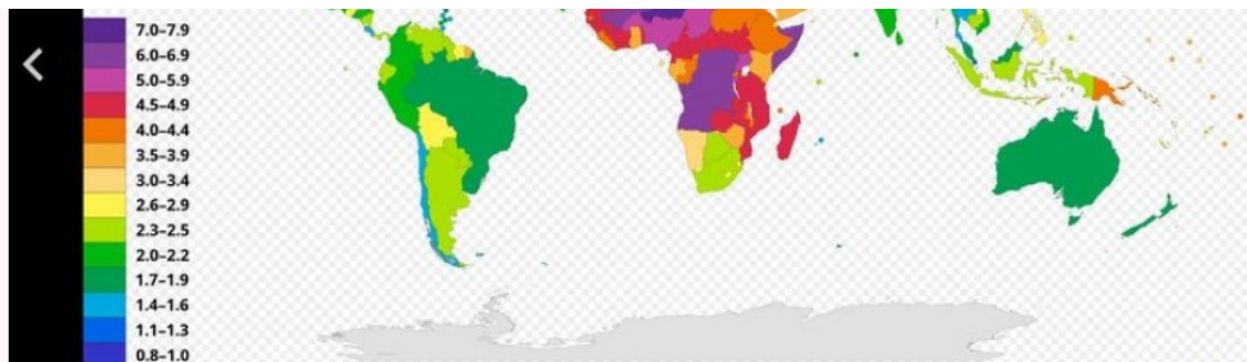
Map of countries and territories by fertility rate (See List of countries and territories by fertility rate. )