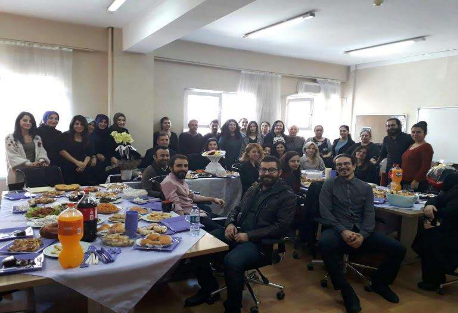
In our school, totally 47 staff work in a harmony.