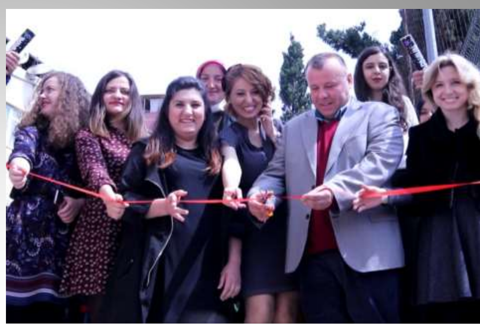
The scientific studies of the students were exhibited in Tübitak Science Fair.