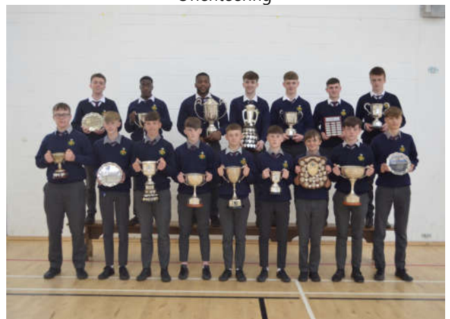
Some of the many trophies won