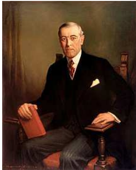
Thomas Woodrow WILSON ( 1856 – 1924 )

In what way Wilson program shows the American will to establish a new democratic world ?