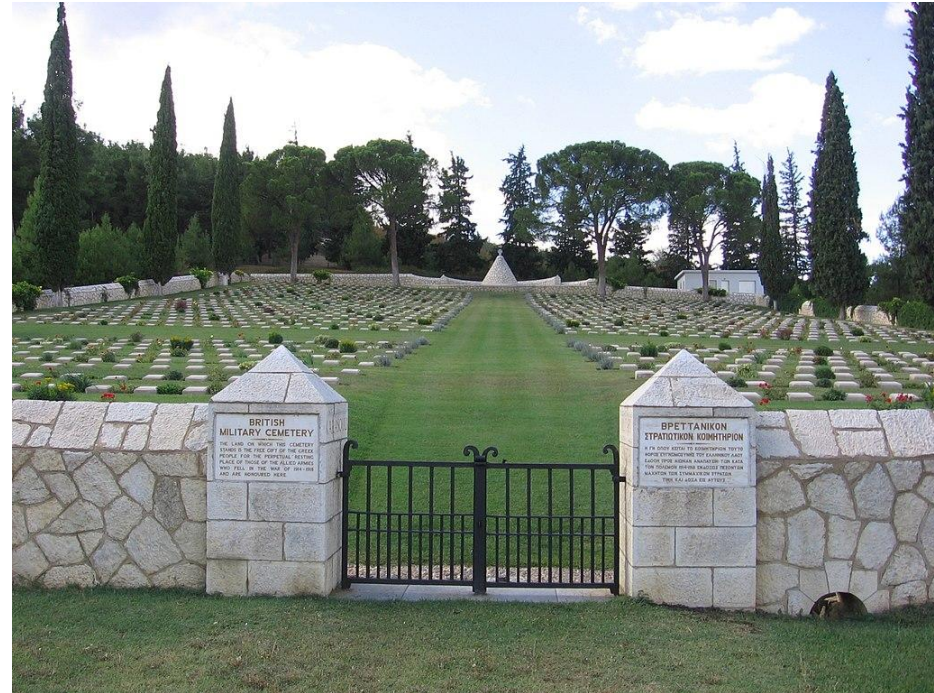
Karasouli Polykastro British Military Cemetery

The Third Battle of Doiran was fought from 18–19 September 1918, with the Greeks and the British assaulting the positions of the Bulgarian Army near Doiran Lake . The battle ended with the Bulgarians repulsing all attacks.