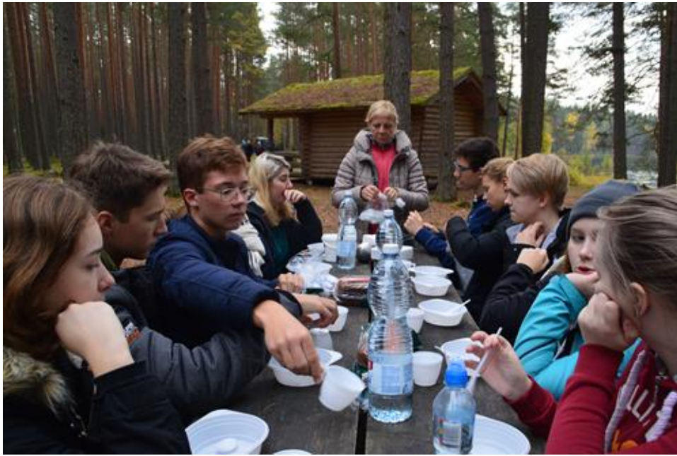
LUNCH IN THE OPEN AIR