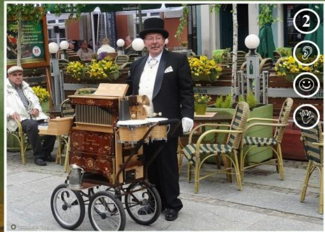
laterna (barrel piano) player