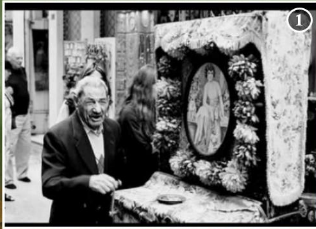
Laterna (barrel piano) player