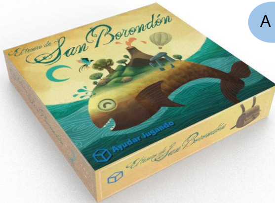
A game for kids