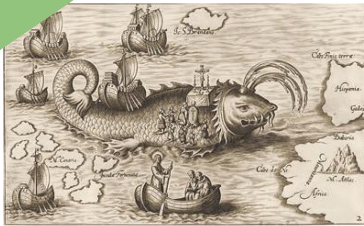
A picture of San Borondón