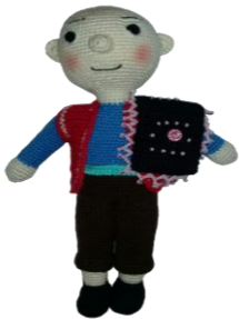
Mascot, name's Keloğlan