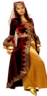
Bindallı, Traditional costume