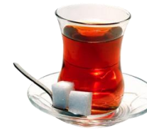
Traditional drink, ÇAY