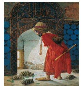
Osman Hamdi Bey, national artist