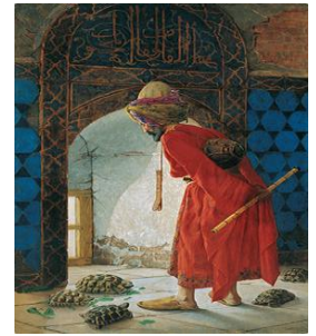
Osman Hamdi Bey, national artist