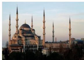
İstanbul, Blue Mosque