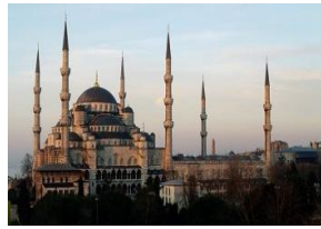
İstanbul, Blue Mosque