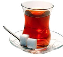
Traditional drink, ÇAY