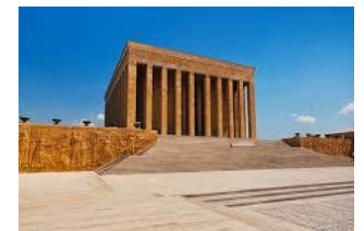
Anıtkabir, Ankara The capital of Turkey