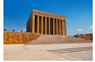
Anıtkabir, Ankara The capital of Turkey